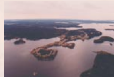
Aerial view of the community of Deschambault Lake (pop. of approximately 1500, economic base is commercial fishing).

The CFDC undertook a Northern Community Banking study to identify secure sites for cash deposits, a secure carrier who could transport the deposits to financial