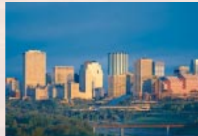
According to the Conference Board of Canada, Edmonton is expected to lead the country with the highest growth rate in 2002. (View of Edmonton skyline.) 1

In 2000, Economic Development Edmonton (EDE) began to develop a strategy to accelerate economic growth within the Greater Edmonton region. The strategy would also help the city to remain competitive