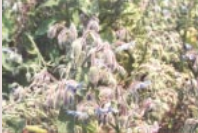
Borage is one of the test crops being explored in the Stonewall area.