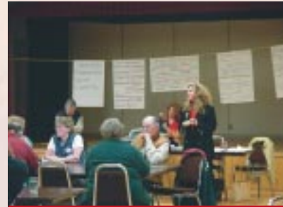
East Central Alberta CFDC hosted a county-wide Priority Setting Workshop in April 2002 at the Ryley Community Hall.

Like other rural communities across the Prairies, Beaver County is troubled with issues of economic and social