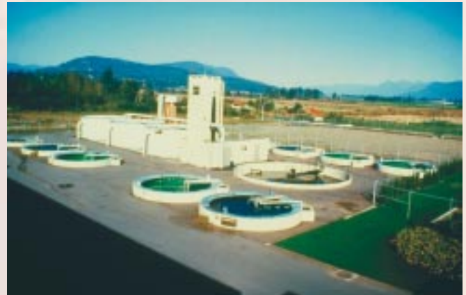
Waste water treatment facilities are among many of the "green" infrastructure projects being undertaken across the West.

As of April 2002, the Infrastructure Canada-Alberta Program had announced 249 projects worth