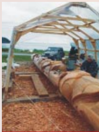
"Carving into the Millennium" at the U'Mista Cultural Centre — part of the expansion and renovation that has allowed tourism-based businesses to thrive at the Centre.

British Columbia's coastal communities were adversely affected by the downturn in the Pacific salmon fishery.