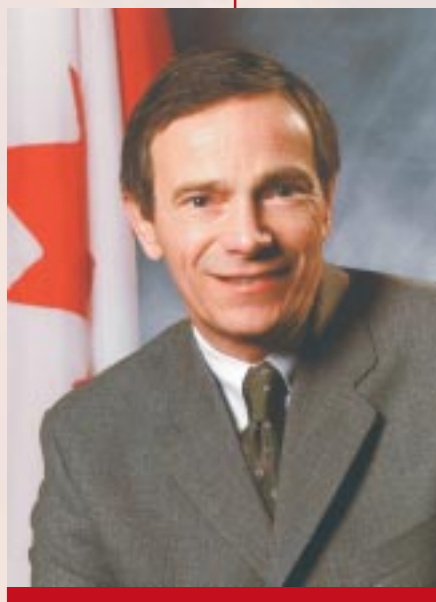
Stephen Owen Secretary of State (Western Economic Diversification)

This year, Western Economic Diversification Canada (WD) celebrates 15 years of working with the West. This is an opportunity to recognize the diverse role that WD has played in building sustainable communities in the West, a region of vast opportunity and tremendous potential.