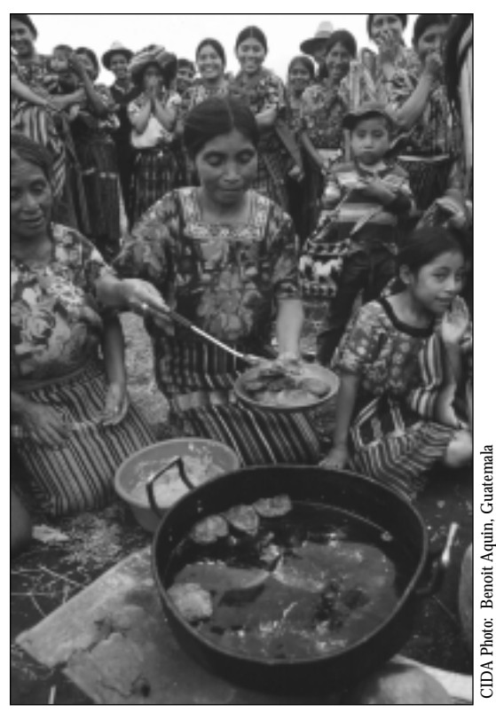
Women play an important role in addressing basic human needs such as nutrition.

businesses and so on) and citizens have responsibilities in this regard as beneficiaries or agents in producing services. Experience shows that participation by individuals and groups concerned allows appropriate response to people's needs, increases the sense of ownership. and ensures the sustainability of activities. This is particularly true of the participation of women. CIDA has conducted a review of its experience and potential in this area (see Annex III: References).