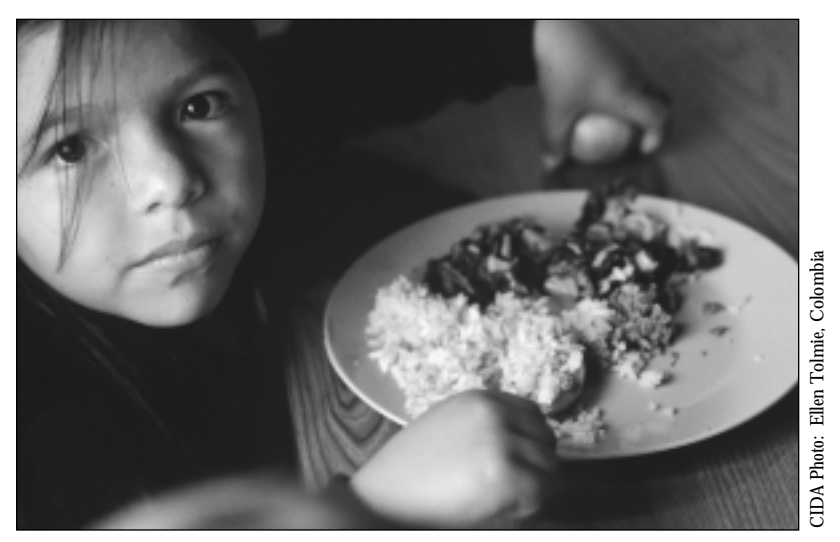
Reducing malnutrition among children under five years of age is a key international priority.