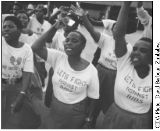
Social mobilization is important in finding solutions to social problems such as AIDS.

• Women: Women often have limited access to social services, and yet they are the ones most responsible for the family. Their work needs to be recognized socio-economically, and workloads need to be better distributed within the family and in society. Women must thus participate fully in the decision-making process regarding the allocation of resources and the establishment of social services for the family, the community and society at large. Canadian cooperation will continue its efforts to ensure that the commitments made at the Beijing Conference are met.