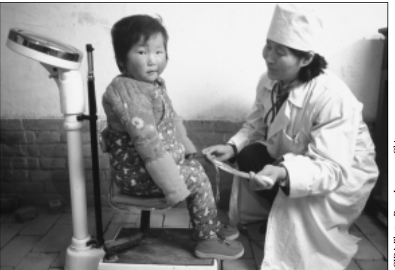
Addressing basic human needs starts at an early age.

♦ Achieving the 25% target: In its policy statement, Canada in the World, the Government of Canada committed itself to allocating 25% of total ODA resources to meet basic human needs, including emergency relief. This total commitment applies to all departments, public and private corporations, and non-profit organizations involved in managing Canadian ODA. CIDA will report on its contribution made in this regard.