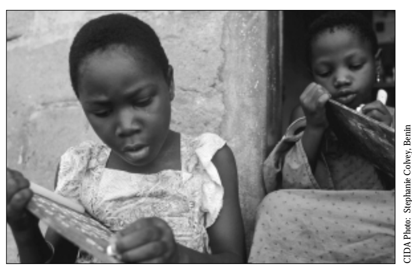
The education of girls has multiplier effects on health, population and income.