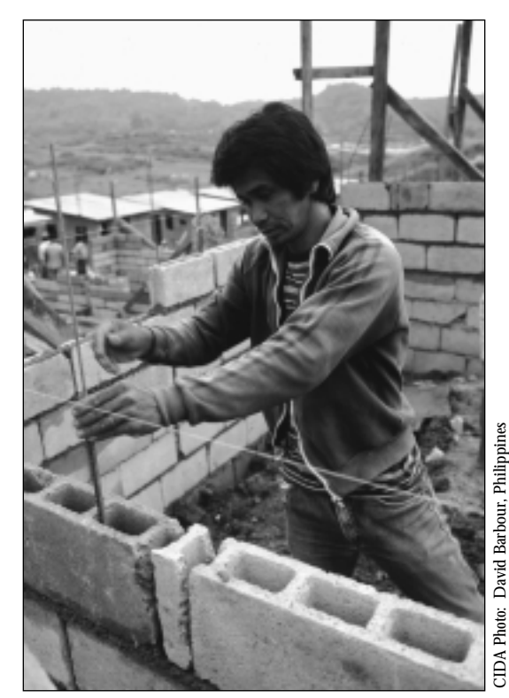
Good housing conditions are often a basis for health and well-being.

◆ Use of counterpart funds – CIDA will encourage consultation with its local partners, so that the funds generated by Canadian aid serve to support projects designed to meet basic human needs, and adequate follow-up is provided. This policy could be applied particularly to counterpart funds generated by food aid, which should be