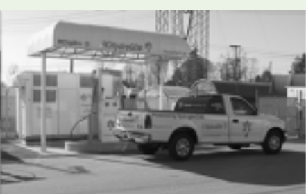
Source: picture taken by Office of the Auditor General, at BC Hydro's Powertech facility