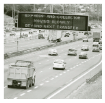
Highway advisory sign that informs drivers of existing traffic conditions