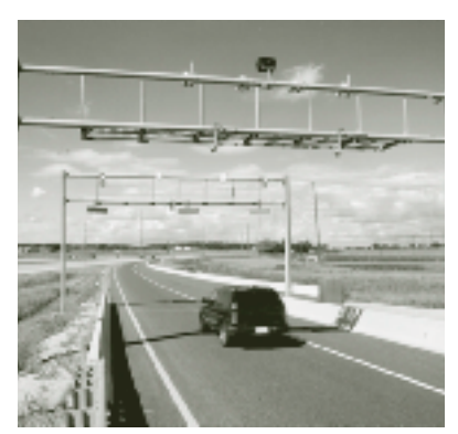
Toll collector devices for vehicles merging onto a toll roadway