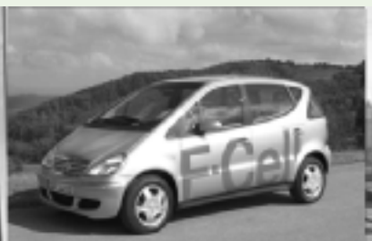
Prototype fuel cell vehicle