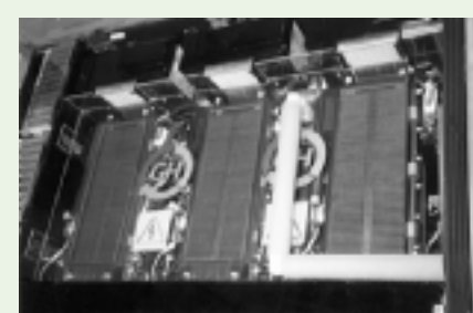
A hydrogen fuel cell system