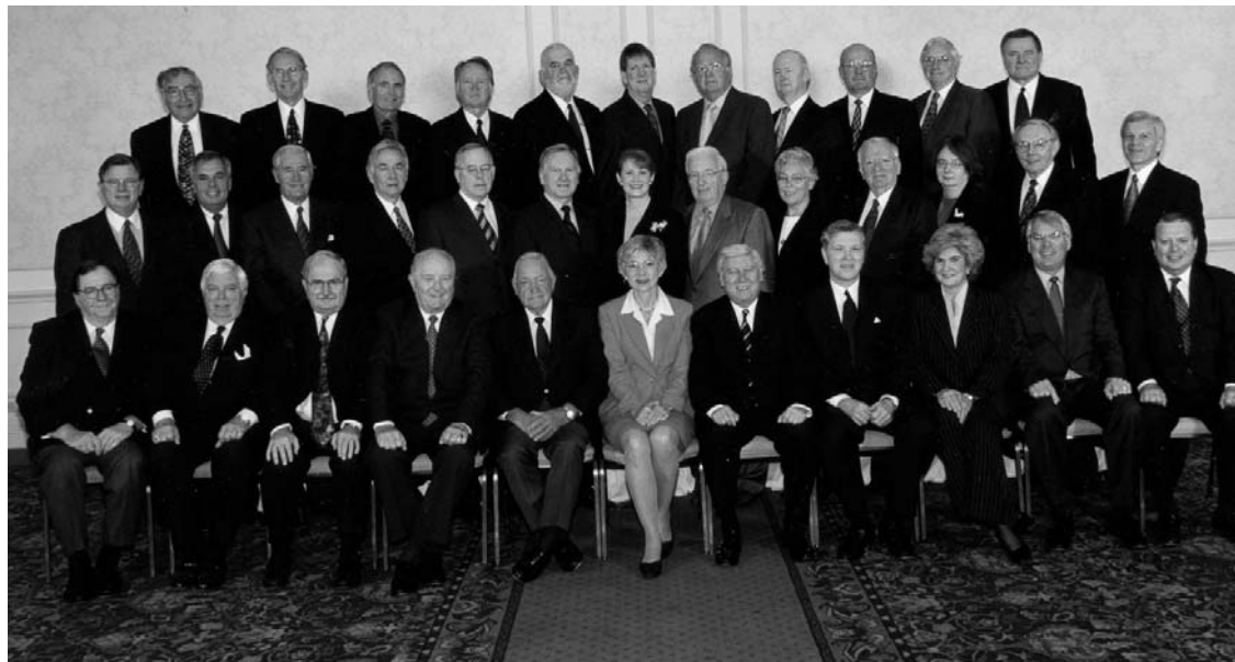
Members of the Canadian Judicial Council at the September 2000 Annual Meeting in Fredericton.