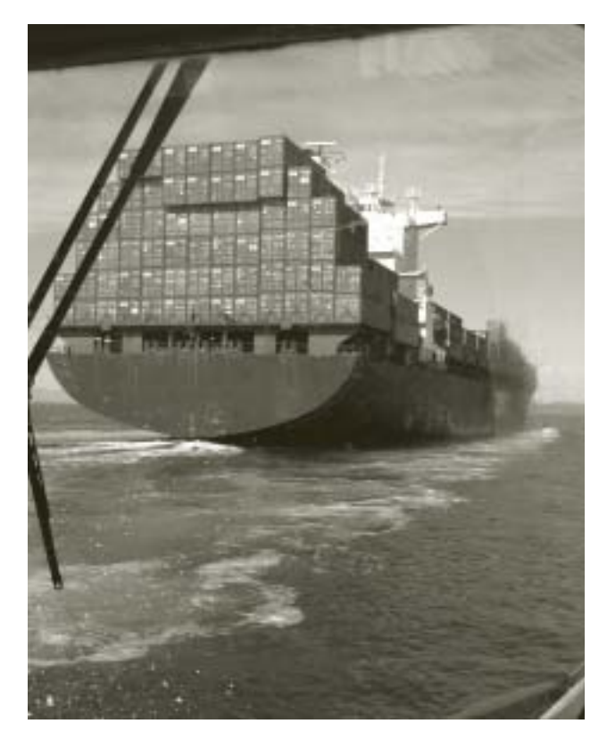
View of container ship from pilot boat near Brotchie, Victoria, British Columbia 2003

As Transport Minister Collenette explained, "The government and the members of the House of Commons Standing Committee on Transport agreed that there needed to be someone in the federal machinery of government to act as the champion for consumers who are dissatisfied with their treatment by airline companies. The key duties of the Commissioner will be to review complaints, to ensure that all alternative solutions have been exhausted and, where appropriate, to mediate an outcome that satisfies both the consumer and the airline."