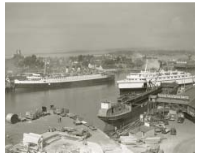
Victoria inner harbour looking southeast British Columbia 1947

The report from the Turgeon Royal Commission was tabled in the House of Commons on March 15, 1951. It recommended an equalization of freight rates; that the Board of Transport Commissioners establish a uniform system of classification of rates throughout Canada, excluding the Maritimes; that the Board establish a uniform system of accounts and reports for the railways; and that the lower rates on grain and flour as set out in the Crowsnest Pass Agreement of 1897 continue. It also