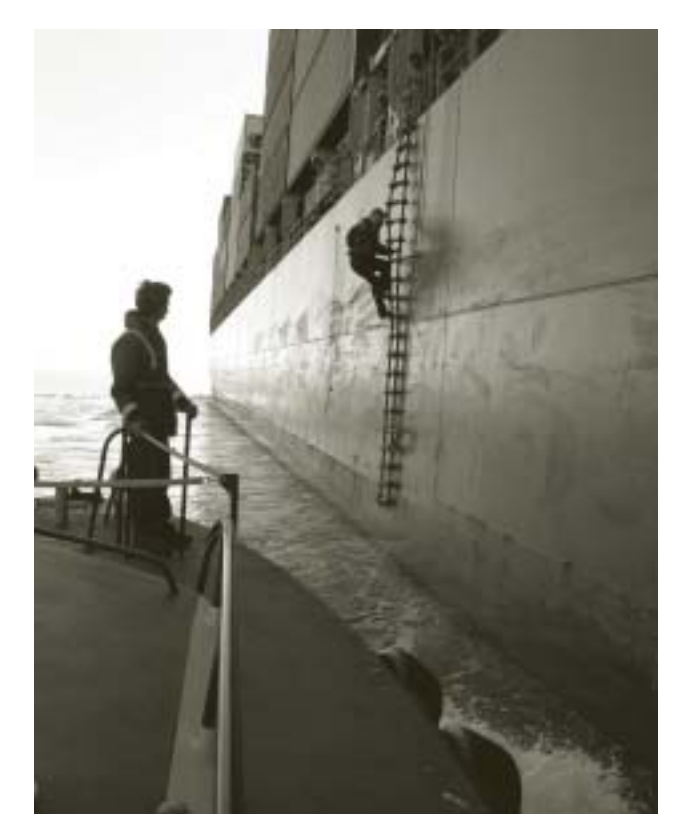
A coastal pilot disembarking a vessel at Brotchie Ledge, Victoria, British Columbia 2003

On April 14, 1997, the Canadian Wheat Board filed a complaint with the Agency against CPR and CNR, claiming that they had not fulfilled their service obligations and that farmers had incurred transportrelated losses of more than $50 million that winter. After several delays, a