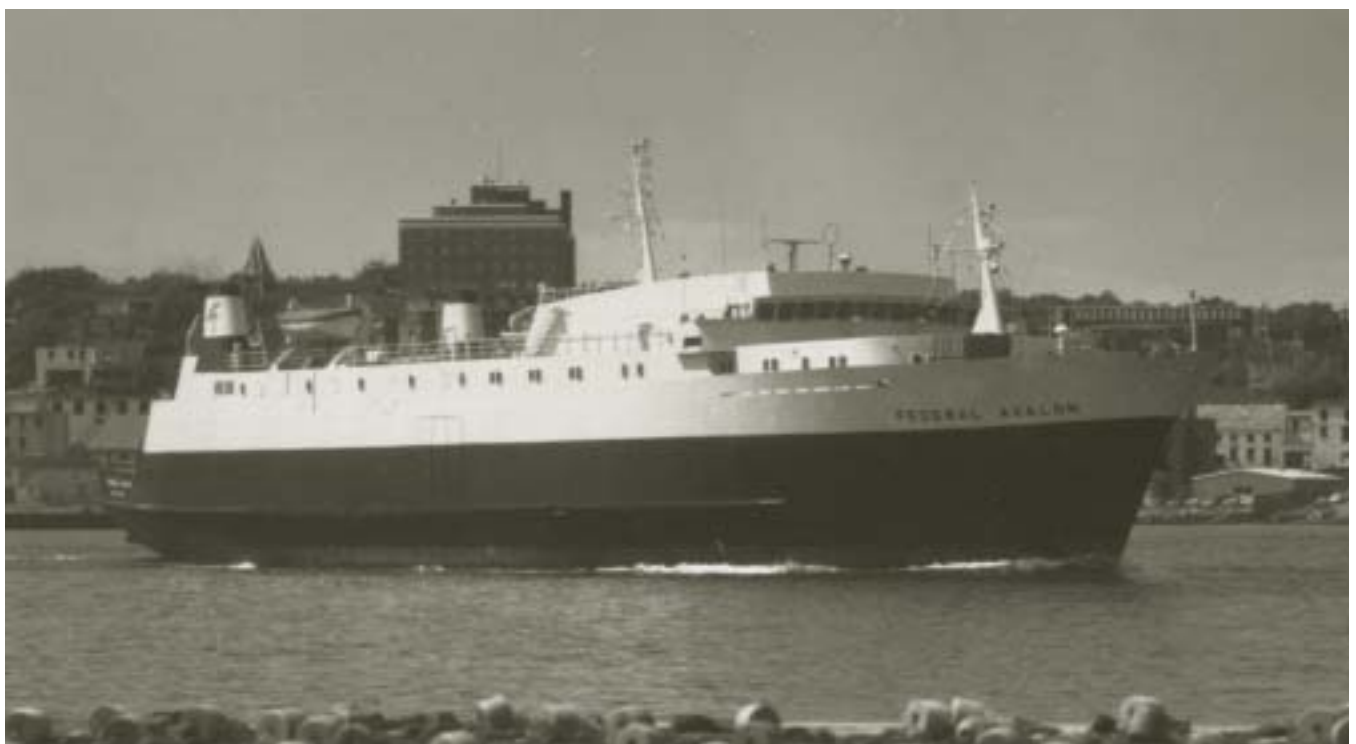
Ferry MV Federal Avalon, St. John's, Newfoundland and Labrador 1975