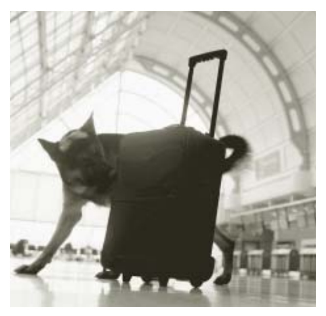
A canine from Greater Toronto Airports Authority Canine Service Unit inspects luggage at Toronto Pearson International Airport, Ontario 2002

On July 18, 2001, the Transport Minister tabled the panel's report in the House of Commons. It was a wide-ranging report that recommended further deregulation of the transportation industry, and a move toward greater competition including, in