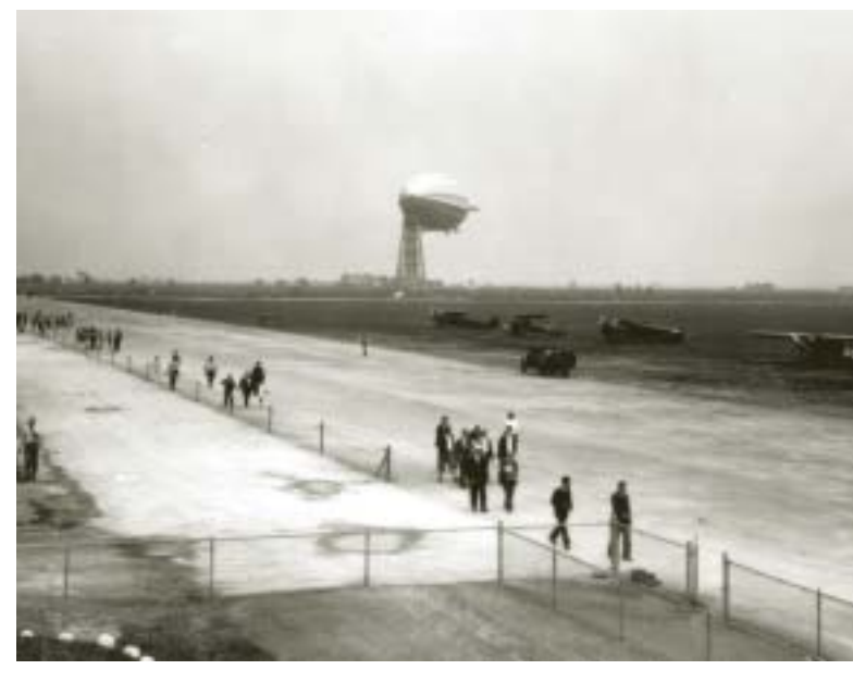
People, airplanes and the R.100 at Saint-Hubert, Québec August 1930

In 1935, a plan for a national airline was being considered by Bennett's government. However, a fall election brought the Liberals back to power and Prime Minister William Lyon Mackenzie King put the transportation portfolio into the hands of Clarence Decatur Howe.