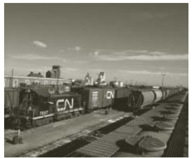
Freight train transporting potash in yard Melville, Saskatchewan 1967

As soon as the Costing Order was issued, the CTC received 31 applications for passenger-train discontinuance, including 18 applications from CPR to discontinue all of its passenger service, except commuter lines. CPR claimed more than $30 million in losses in 1968. CNR filed applications for 13 services, claiming losses of more than $11 million. The CTC set to work to determine actual losses, and then, as required by statute, to begin