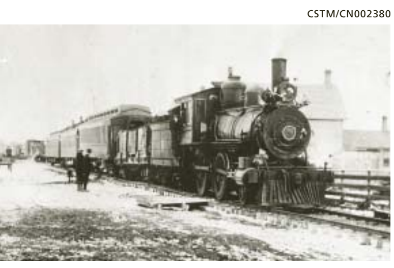
First passenger train to Edmonton from Winnipeg Canadian Northern Railway Company, 1905

The Agency's story began with the establishment of the Board of Railway Commissioners in Ottawa on a snowbound February day in 1904.