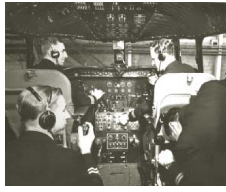
A TCA crew aboard a Canadair DC-4M North Star, 1950

points in Canada, or between specified points in Canada and outside, but the actual points and places of its jurisdiction would be determined by cabinet.