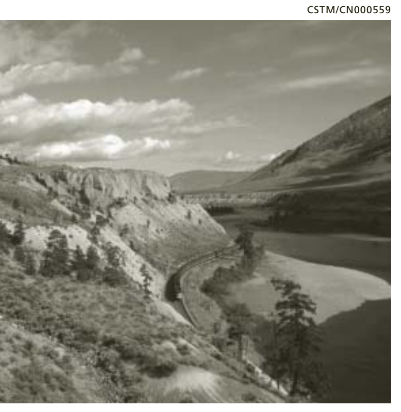
Aerial view of a westbound train near Kamloops, British Columbia 1975

from competition and back to regulation with the top priority being service to Canadians.