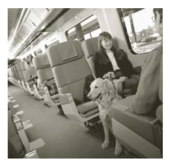
A passenger with visual impairment and guide dog aboard a VIA Rail train

Meanwhile the fare wars being fought in the Canadian skies were making some people nervous. PWA had announced in