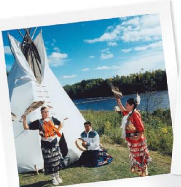
Manitou Mounds, Stratton