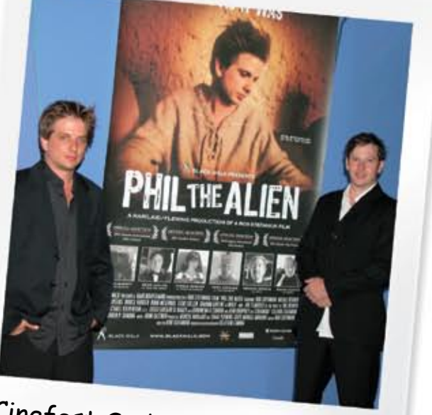
Cinefest Sudbury International Film Festival, Sudbury

This investment has resulted in an additional half a million new visitors per year whose spending supports over 18,000 jobs.