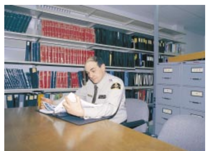
Some parks have extensive and well-organized resource centres, others are in disarray

Written documentation is also poorly maintained. Park libraries are in disarray. During the downsizing of Parks Canada over the last five years, park libraries were often casualties. We were told of libraries, with hundreds of original reports, stored in boxes that were placed in damp storage. The document collection at the National Documentation Centre is incomplete due to poor collaboration from the Field Units.