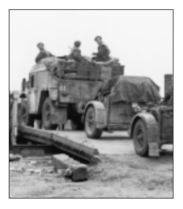
TEMPORARY BRIDGE BUILT BY THE ROYAL CANADIAN ENGINEERS AND THE BELGIAN FORCES OF THE INTERIOR, FURNES, SEPTEMBER 1944.

Meanwhile, Lieutenant-General Simonds concentrated on the area north of South Beveland. The 4<sup>th</sup> Canadian Armoured Division, which had been engaged at the Leopold Canal, moved north of the Scheldt and drove hard for the town of Bergen-op-Zoom. By October 24, access to South Beveland was sealed off.