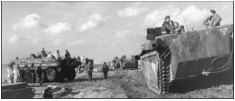
COLUMN OF "ALLIGATOR" AMPHIBIOUS VEHICLES PASSING "TERRAPIN" AMPHIBIOUS VEHICLES ON SCHELDT RIVER, OCTOBER 1944. (NATIONAL ARCHIVES OF CANADA 114754)

The 2<sup>nd</sup> Canadian Infantry Division's 4<sup>th</sup> Brigade then moved to the southern outskirts of Bruges to assist the 4<sup>th</sup> Canadian Armoured Division in that sector. Fortunately, the enemy withdrew without contesting possession of the city, and the Canadians entered the city to an enthusiastic welcome from the Belgian people. The 4<sup>th</sup> Brigade then turned back and attacked Bergues, a key part of Dunkirk's outer defences, which fell on September 16.