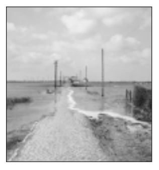
ROAD FLOODED BY GERMAN FORCES NEAR FURNES, SEPTEMBER 1944.

Le Havre, Boulogne and Calais were taken by the 3<sup>rd</sup> Canadian Infantry Division only after massive attacks, with combined air and ground assaults. Because of these attacks, the port installations were largely destroyed and would require months of repair before they could be made operational for Allied shipping. On October 1, the only harbours north of the Seine