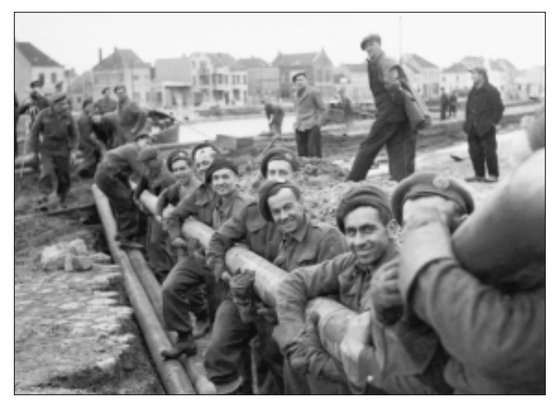
ROYAL CANADIAN ENGINEERS LOWERING PIPE INTO ROADWAY EXCAVATION, OSTEND, OCTOBER 1944.

During the Second World War, Belgium was the scene of major fighting by the First Canadian Army from September to November 1944. The Canadians were given the important tasks of clearing coastal areas in the north of France and capturing the launching sites of German rockets and put an end to their attacks on southern England. The First Canadian Army also played a leading role in opening the Scheldt estuary (tidal river), gateway to the Belgian port of Antwerp. Access to this port was essential to maintain supply lines to the Allied armies as they continued their push towards Germany to defeat Adolf Hitler's forces and free Western Europe from four years of Nazi occupation which had begun in April 1940.