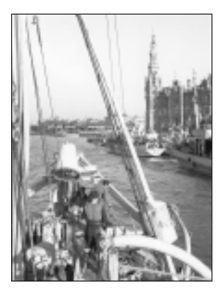
SWEEPERS RETURNING TO ANTWERP DOCKS, NOVEMBER 1944. (NATIONAL ARCHIVES OF CANADA 42887)