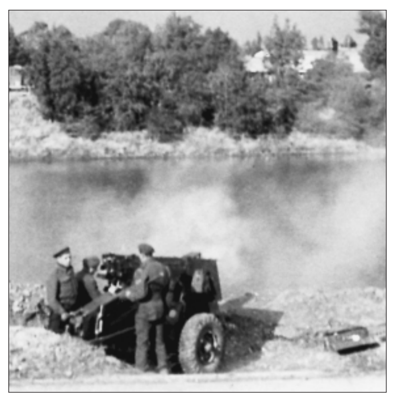
CANADIAN SOLDIERS FIRING FROM SCHELDT RIVER ON GERMAN POSITIONS NORTH OF ANTWERP, OCTOBER 1944.

only land approach was the long narrow causeway from South Beveland. To make matters worse, the flats that surrounded this causeway were too saturated with sea water for movement on foot, but had too little water for an assault in storm boats.