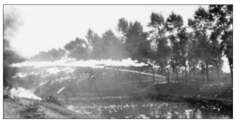
4<sup>TH</sup> CANADIAN ARMOURED DIVISION DEMONSTRATING THE USE OF FLAME THROWERS ACROSS A CANAL, BALGERHOCKE, OCTOBER 1944.

On September 9, the 2<sup>nd</sup> Canadian Infantry Division's 4<sup>th</sup> Brigade moved north to occupy the Belgian port of Ostend. This port, although fortified, was not defended by the Germans. The harbour installations, however, had been partly demolished which delayed its opening. Still, on September 28, stores and bulk petrol began flowing through Ostend which provided much-needed supplies to the Allied front.