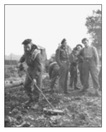
SAPPER, RCE SWEEPING FOR MINES AT ROADBLOCK NEAR KAPPELLEN, OCTOBER 1944.