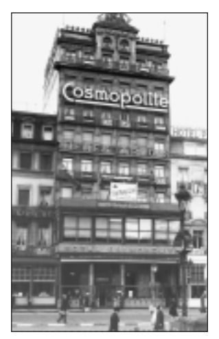
Cosmopolite Hotel, REQUISITIONED AS THE "MAPLE LEAF" LEAVE CENTRE, BRUSSELS, OCTOBER 1944.

At this point, the challenge and opportunity was clear to all, and