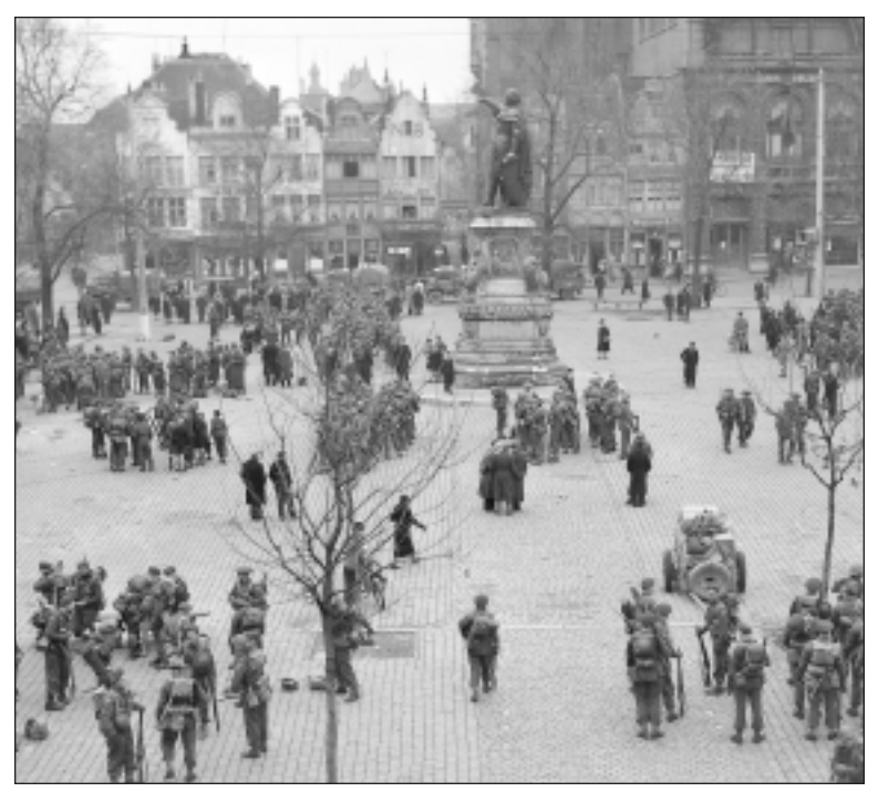
CANADIAN TROOPS PREPARING TO LEAVE GHENT, NOVEMBER 1944.

The 2<sup>nd</sup> Canadian Infantry Division attacked the causeway on October 31 and, after a grim struggle, established a precarious foothold. Then, in conjunction with the waterborne attacks, the 52<sup>nd</sup> British Division continued the advance. On November 6, the island's capital Middelburg fell, and by November 8 all resistance ended.