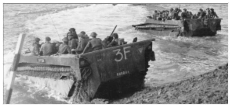
"Buffalo" amphibious vehicles taking troops across the Scheldt in Holland.

First World War Canadian battles). On September 7 they reached Roulers, Belgium.