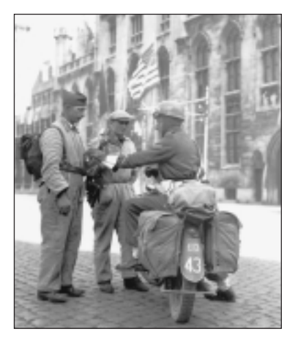
MEMBER OF CANADIAN PROVOST CORPS TALKING TO MEMBERS OF THE BELGIAN RESISTANCE, BRUGES, SEPTEMBER 1944.

The 4<sup>th</sup> Canadian Armoured Division had advanced from a hard-won bridgehead over the Ghent Canal at Moerbrugge to find themselves the first Allied troops to face the formidable obstacle of the double line of the Leopold and Dérivation de la Lys Canals. An attack was mounted in the vicinity of Moerkerke. The canals were crossed and a bridgehead established,