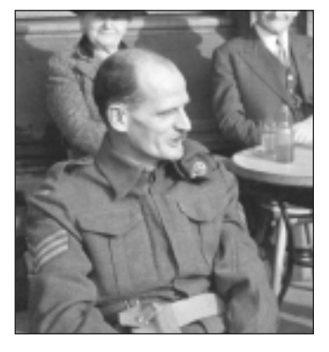
Soldier in a café in Antwerp, September 1944.

were horrendous as the enemy recovered from the shock of the flamethrowers and counterattacked. However, the troops clung with grim determination to their extremely vulnerable bridgeheads. By October 9, the gap between the bridgeheads was closed, and by early morning on October 12, a position had been gained across the Aardenburg road.