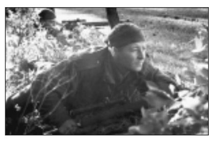
SCOUTS OF CALGARY HIGHLANDERS ADVANCING NORTH OF KAPPELLEN, OCTOBER 1944.

On September 7 and 8, the 2<sup>nd</sup> Canadian Infantry Division's 5<sup>th</sup> Brigade captured Bourbourg, southwest of Dunkirk, and then worked to contain the Dunkirk garrison. The Germans had an estimated 10,000 troops in Dunkirk,