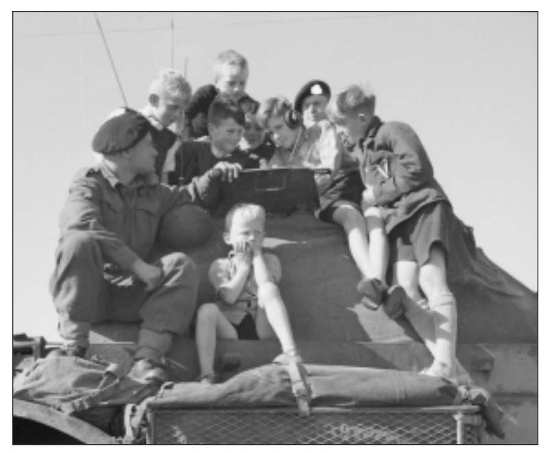
18<sup>TH</sup> ARMOURED CAR REGIMENT AND BELGIAN CHILDREN, BLANKENBERGE, SEPTEMBER 1944.

As the fourth phase of the battle opened, only the island of Walcheren at the mouth of the West Scheldt remained in enemy hands. The island's defences were extremely strong and the