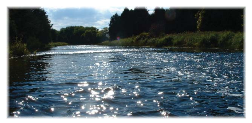
A reflective surface hides the vast world of habitats and fish below.

often at the foot of low falls that may prevent any further migration. As far as these and many other fish species are concerned, a lake's health extends well beyond its perimeter.