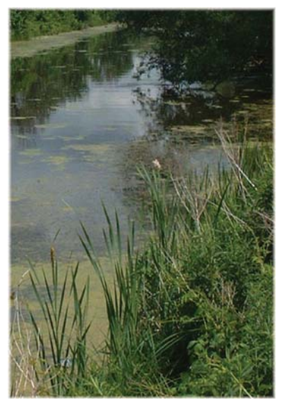
Wetlands are spawning grounds and nurseries to a variety of fish species.

Sometimes dry and sometimes wet, wetlands share characteristics of both dry