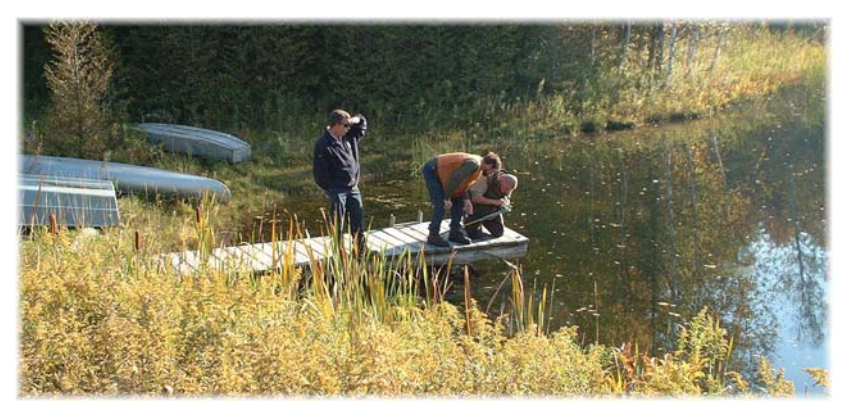
The water's edge: what we do on the shoreline can affect fish habitat.

Why stay put in the same familiar habitat when you can explore and reap the benefit of others? Waterways are all connected, and many fish use this to their full advantage by moving from one freshwater neighbourhood to another as they pass through different life stages. By understanding the wide-ranging needs of fish that are served by creeks, streams, rivers, ponds and lakes, we can better appreciate what fish are up against when we interfere with their environment.