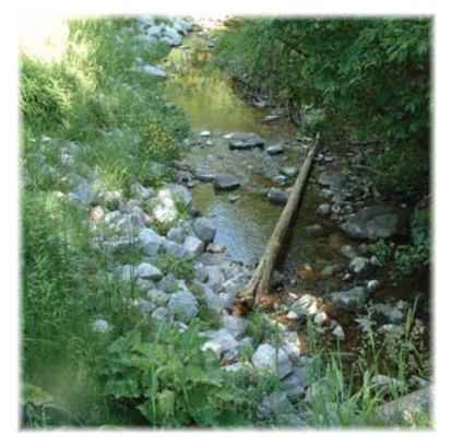
Fallen logs and rocks provide cover for insects and fish.

Fish, depending on the species, can be both predator and prey. As prey, fish increase their chances of survival by seeking out hiding places where they evade predators. Great hiding places are often found in the shallows where logs, boulders and aquatic vegetation can be found. When we clear these materials from