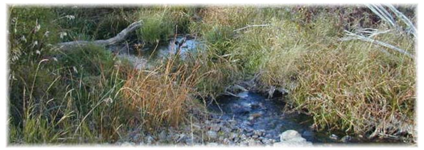
Although it may look messy, it is home and a source of food for fish.