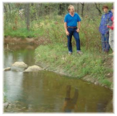
Talk to your local government agencies before planning work in or around water.

These agencies will review your project proposal and point out better approaches or any regulatory pitfalls. They will also be able to advise you on any provincial requirements or approvals.