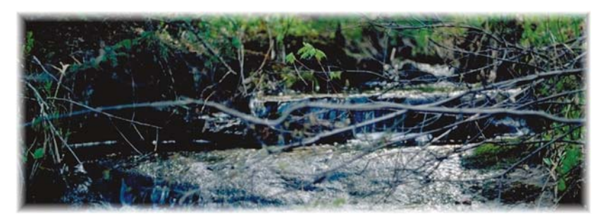
Wetlands, creeks, streams, rivers and lakes; we are all connected.

Creeks, streams and rivers generally provide a variety of habitat types, including the more commonly known pool and riffle formations. A riffle zone is often characterized by shallow rapid areas of rivers that tumble and bubble over rocks and boulders to trap oxygen in the water. Trout, walleye and white suckers prefer to lay their eggs in this oxygen-rich water, which helps the eggs breathe. Riffles also play a key role in food