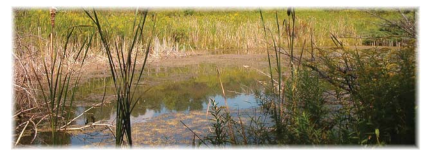
Wetlands provide spawning, nursery and feeding grounds for fish while filtering out impurities and buffering waterways from flood waters.

The northern pike leaves its eggs in the care of the wetland, attached to standing plants from the previous growing season. To us, the vegetation may look like an untidy mess, but it means everything to the eggs' survival. The wetland vegetation keeps them from sinking into the bottom muck where they would either suffocate or be devoured by other aquatic organisms.