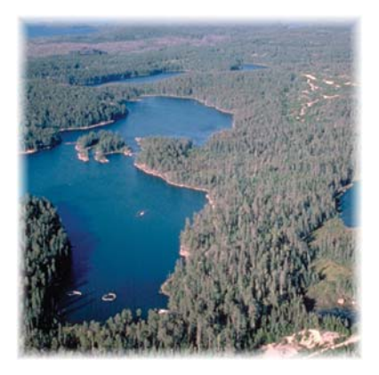
Lakes provide a variety of fish habitat.

The streams and rivers that enter and exit lakes are also a critical part of the picture for fish. Some species that use open lake water habitat to support their adult lives also depend on these adjoining watercourses to reach their spawning grounds. In the spring, the white sucker may migrate from the lake into gravelly streams to spawn. The lake sturgeon also migrates into rivers to spawn in areas with swift water or rapids,