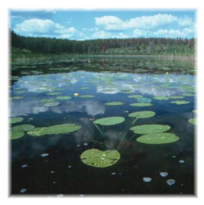
Vegetation in and around the water provides shade, hiding places and food.

our shorelines to "tidy up" the swimming area, we have carried out an unwanted house cleaning for the resident fish populations. Other potential hideouts can be found in deep water and in the shadows of an undercut stream bank. The types of hideouts might even vary over the course of a fish's lifetime. As an example, the young northern pike lurks at the edge of shorelines near vegetated areas and fallen logs to escape bigger fish predators. As the pike grows bigger, it ventures further offshore to deeper water to use aquatic plants and submerged timber as cover so that it can ambush prey of its own.