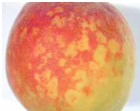
Pox symptoms of plum pox virus on a peach grown in Niagara.

As well, a team of AAFC researchers was able to generate a PPV-resistant germplasm and develop a highly efficient technology for gene transfer. This was accomplished with the assistance of AAFC researchers at the Southern Crop Protection and Food Research Centre in London, Ontario, the Eastern Cereal and Oilseed Research Centre in Ottawa and the Pacific Agri-Research Centre in Summerland, British Columbia.