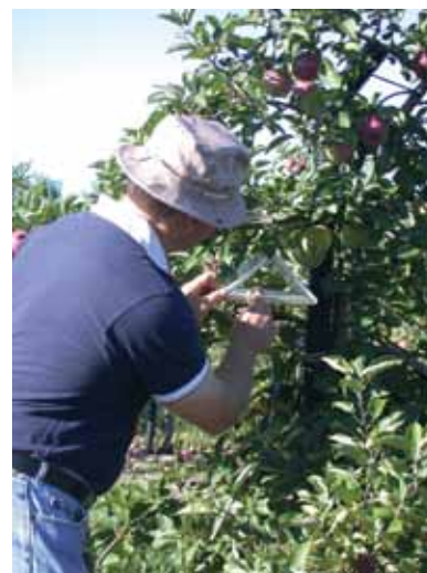
Inspecting a pheromone-baited trap for monitoring the activity of obliquebanded leafrollers in an orchard.