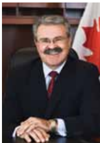
Gerry Ritz, P.C., M.P. Minister of Agriculture and Agri-Food

I would like to take this opportunity to congratulate the Vineland Research Station as it celebrates 100 years of excellence in agricultural research.