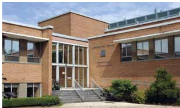
Agriculture and Agri-Food Canada's Vineland Research Station, 1968-present.