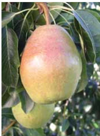
Vineland Harovin Sundown Pear.

To date, AAFC has introduced six fire blight-resistant pear cultivars for commercial production in Canada: ‘Harrow Delight’ (1981), ‘Harvest Queen’ (1981), ‘Harrow Sweet’ (1990), ‘AC Harrow Crisp’ (2000), ‘AC Harrow Gold’ (2000) and ‘Harovin Sundown’ (2008). Three additional selections will be introduced in the near future.