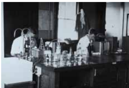
Scientists working at former plant pathology lab circa 1930.