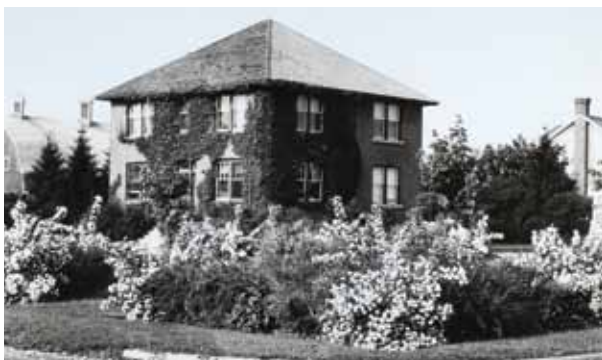
Dominion Entomological Laboratory in Vineland, 1934.

Today the Vineland Research Station conducts research on a range of horticultural issues relating to plant pathology, entomology and tree fruit breeding. The research being conducted at the Research Station addresses specific ag-sector needs and priorities. Key to the many research successes is the hard work of the research scientists, support staff, technicians, field crews and students. Although the Vineland Research Station has gone through many changes over the years, its commitment to research excellence remains unchanged.