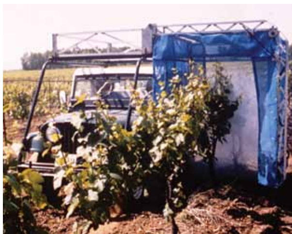
Custom engineered sprayer for pesticide application.

For example, peach canker studies identified factors contributing to increased fungicide resistance and the effect of fungicides on orchard microflora. Peach canker toxin, identified by AAFC researchers, was used to screen for resistance in tissue cultured seedlings. The seedlings were added to the clonal peach material and evaluated for canker resistance and other desirable horticultural characteristics, thereby helping to develop trees resistant to peach canker.