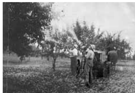
Applying pesticides on the research farm, 1940.

"Amongst other things, AAFC Vineland Research Station has played a vital role in crop protection materials, testing and evaluation. The Tender Fruit Industry looks forward to our continued partnership for the next hundred years."