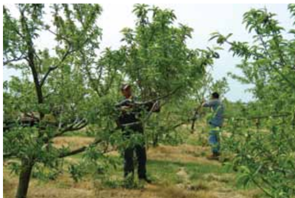
Pruning peaches at the Jordan Farm orchards.

"Research and innovation are the building blocks of Canada's plant science industry. The cutting-edge research done at facilities like the AAFC Vineland Research Station helps provide Canadian farmers with the crop protection tools they need to supply a healthy, abundant and affordable food supply to consumers now and into the future."