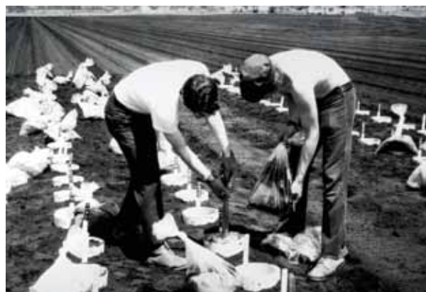
Nematology researchers installing nematode experiments in a field.

Vineland Research Station's expertise and efforts in nematology, virology and battling bacteria have resulted in a win-win situation for all those concerned - fruit growers, the horticultural industry, the environment and Canadian consumers who enjoy the fruits of their labours!