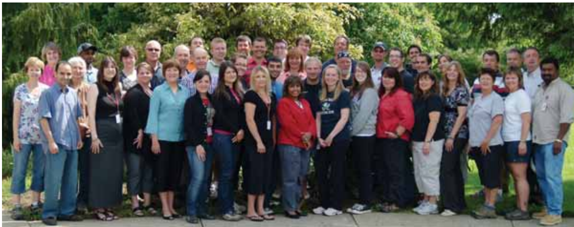
The staff, field crews, technicians, support staff and students of the Vineland Research Station today.