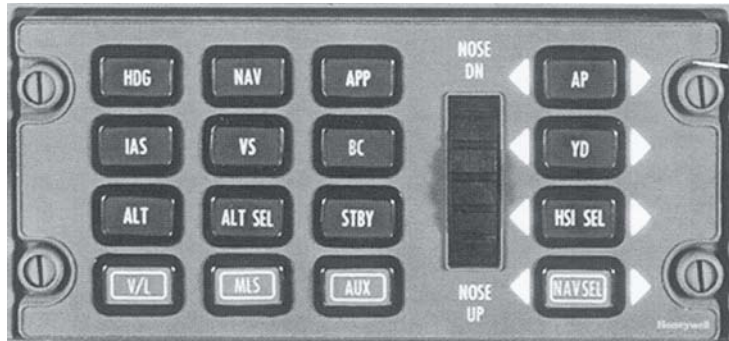
Figure 1. Flight guidance controller

Through about 8000 feet, the airspeed started a gradual decrease from 170 KIAS over a period of five minutes. During this time, the vertical speed continued at a constant 1190 fpm up. The gradual decrease in airspeed was detected when the first officer looked up from his paperwork, noted the decreased airspeed, and advised the captain. The captain then rotated the pitch control wheel on the flight