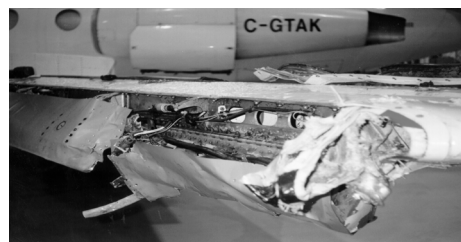
Outer left wing

The left wing sustained the following damage: approximately three feet of the outboard droop leading edge was torn loose and curled under the wing; the outboard wing extension lower skin was twisted; and the aileron and outboard flap panel exhibited minor damage. The left wing inboard droop and fixed leading edges exhibited several substantial impact marks.