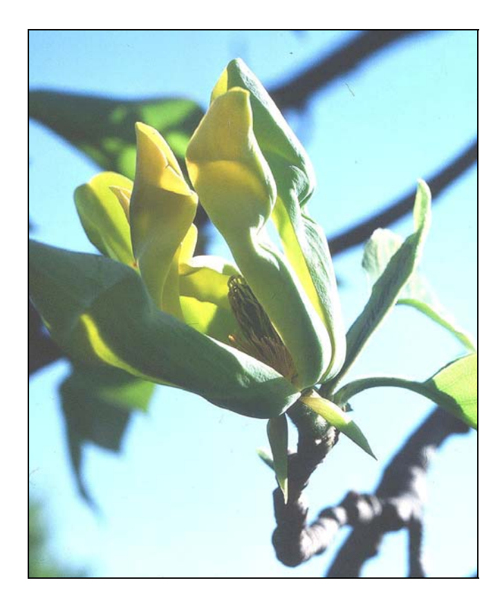
Figure 1. A single flower of Cucumber Tree.

Cucumber Tree is a forest canopy species that can reach 30 m in height. Its leaves are simple, 10-24 cm long and oblong-ovate to elliptic in shape with a pointed tip and alternate in attachment on short stalks. The buds have a single scale covered with short downy hairs. The bark is brownish-grey and longitudinally furrowed into loose scaly ridges. Flowers are solitary, greenish-yellow and 6-8 cm long (Figure 1). Fruits are cone-like (Figure 2), 3-8 cm long bearing seeds with a fleshy orange to scarlet seed coat. At maturity, the seeds are suspended by long slender threads from the opened follicles of the red cone-like fruit.