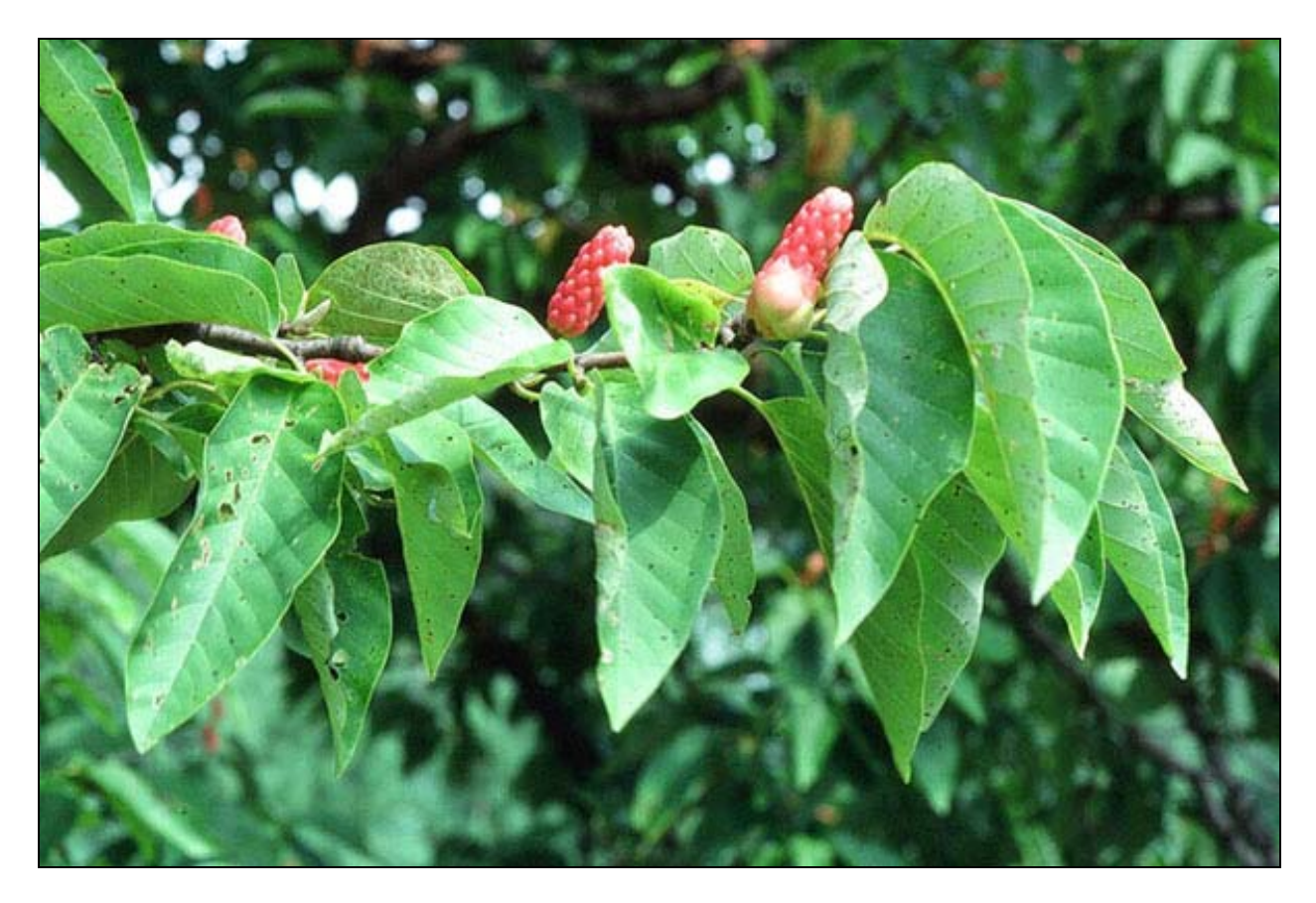
Figure 2. Leafy branch of Cucumber Tree with upright, red, immature cone-like fruits.