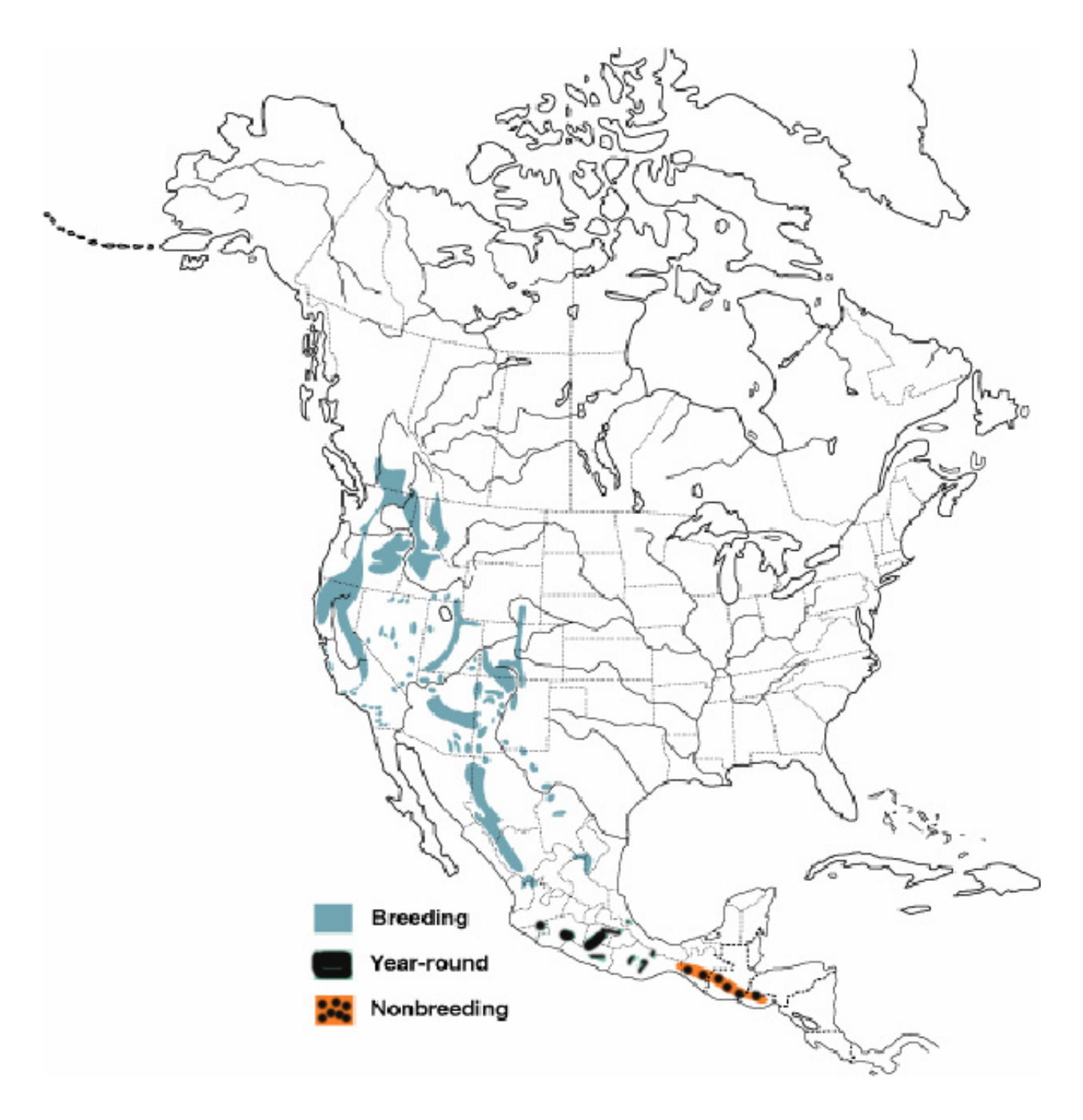
Figure 2. Distribution of the Flammulated Owl (modified from McCallum 1994).