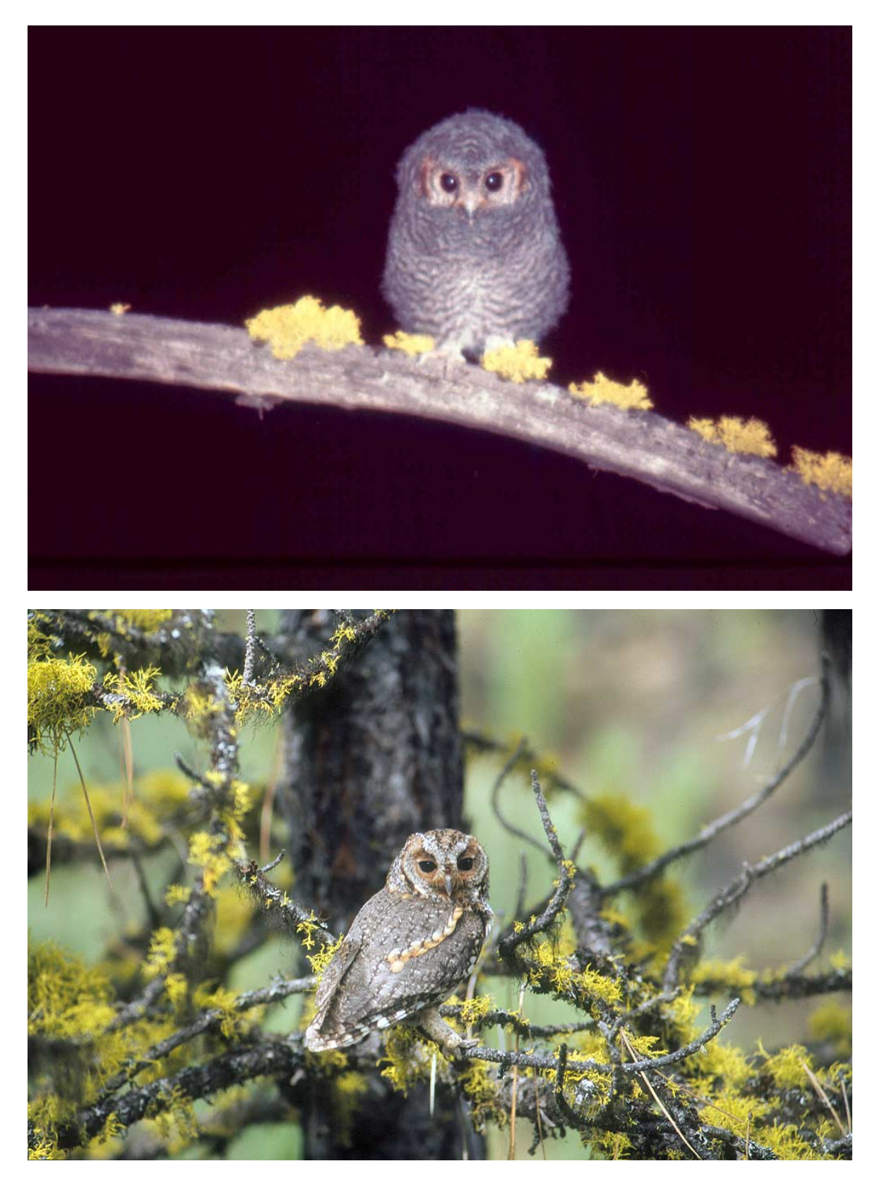
Figure 1. Flammulated Owls: juvenile (above) and adult female (below).