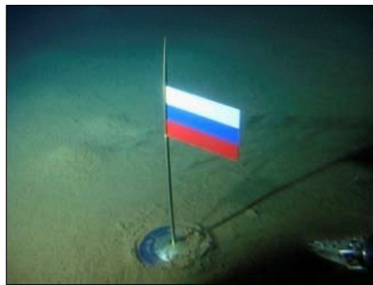
Russian Flag on the Arctic Sea Bed

Within existing frameworks of international law, the concept of sovereignty is rooted in the manifestation of territorial control and jurisdictional authority. Sovereignty is increasingly associated with a responsibility toward the safeguard of citizens, and as such, increased expectations are placed on Canada not only to show a strong presence in the Arctic waters, but also to enact and enforce laws and regulations that govern the country.