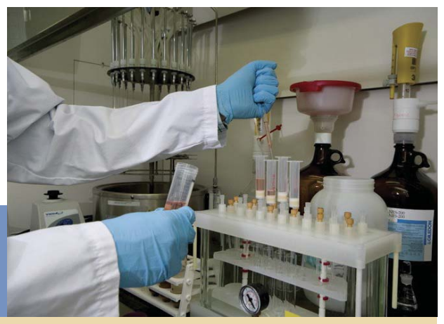
CFIA laboratory samples

Determining the prevalence of hazards and the risk of contamination in the food supply is a major focus of ongoing actions to build a national food safety surveillance system for Canada, and now a new specialized laboratory project at the Canadian Food Inspection Agency is making a significant contribution to these efforts.