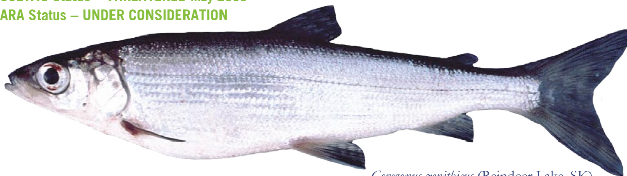
Coregonus zenithicus (Reindeer Lake, SK)

This species has been identified as Threatened by the Committee on the Status of Endangered Wildlife in Canada (COSEWIC). It is currently being considered for listing under the federal Species at Risk Act