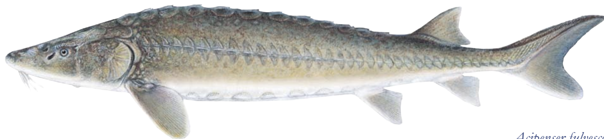
Acipenser fulvescens © J.R. Tomelleri

Eight designatable units have been identified for Lake Sturgeon based on genetic and biogeographical distinctions. Within the Western Hudson Bay designatable unit (DU1), this species has been identified as Endangered by the Committee on the Status of Endangered Wildlife in Canada (COSEWIC).