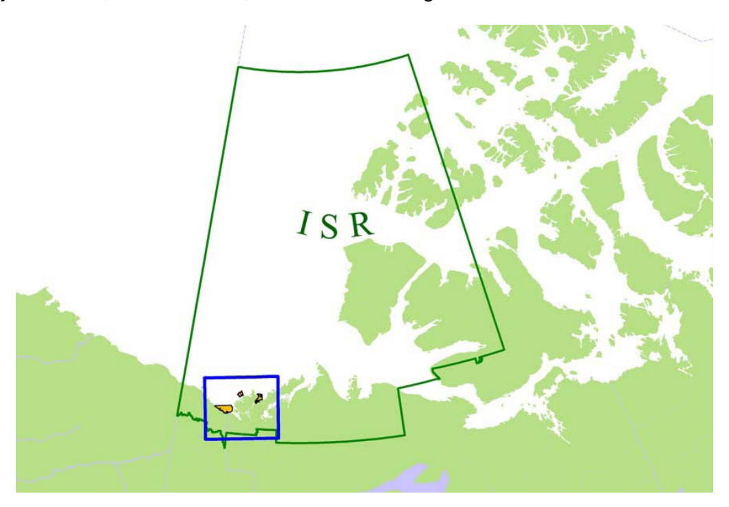
Figure 1. Inuvialuit Settlement Region (ISR) with Tarium Niryutait Marine Protected Area (Zone 1a beluga areas) shown inside box outline.

TNMPA sub-areas correspond to Zone 1a of the BSBMP (FJMC 2001). There is a wealth of traditional knowledge about the TNMPA and ISR that can be found in socio-economic reports produced by DFO Oceans Programs Division. This report has a marine aquatic science-based advisory focus and, for that reason, traditional knowledge is not included here.