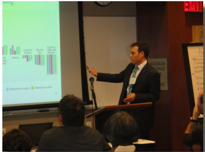
Vancouver Session, February 17, 2011