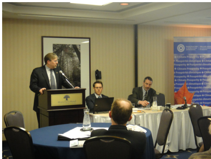
Ottawa Session, March 8, 2011

Overall, we heard fairly broad support for a technology fund. Stakeholders in all regions supported the idea that technology was a key element in reducing Canadian emissions. One stakeholder noted that insufficient technological change would be stimulated at low carbon prices, so a technology fund would likely be necessary. Others noted that a technology fund would allow for collaborative partnerships with government to provide necessary funding to scale up large projects. Still, some stakeholders suggested the technology fund as proposed in the NRTEE report was problematic in that it would reduce the emissions reductions that would occur in Canada in 2020 as a result of limiting the carbon price.