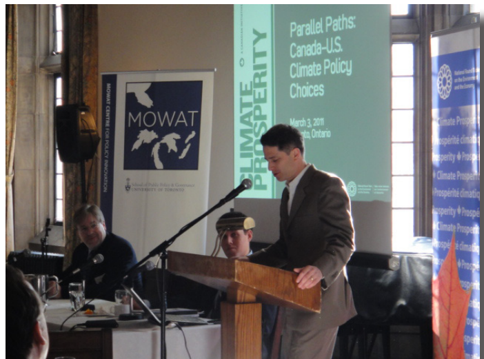
Toronto Session, March 3, 2011

The other key dimension of policy design discussed at all the regional meetings was the issue of stringency. The stringency of a policy determines the strength of the incentives or requirements they impose and is relevant for both market-based and regulatory approaches. On this issue, we heard a very broad range of opinion.