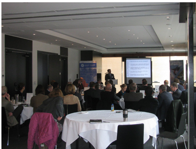
Calgary Session, February 22, 2011

Multiple stakeholders expressed strong support for the NRTEE in tackling the issue of Canadian climate policy in the context of U.S. policy. Stakeholders recognized that the issue of harmonization with the U.S. was an important and relevant one for Canada, and several participants acknowledged that deeper analysis of harmonization and what it meant for Canada were both necessary and needed. And in the context of the failure of a national climate bill in the U.S. Senate in 2010 and potential delays in regulation under the Clean Air Act through the Environmental Protection Agency (EPA), Canada must make its own choices as to how it will proceed.