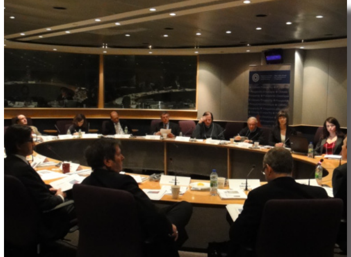
Montreal Session, March 1, 2011

To some extent, almost all of these issues were raised at all workshops. The Vancouver and Montréal sessions put particular emphasis on the environmental imperative, though the issue was raised elsewhere as well. The Calgary and Toronto sessions placed particular importance on the economic drivers, including the need for certainty and avoiding border adjustments. Issues of international reputation were raised most frequently in the Toronto workshop. Opportunities for Canada in low-carbon technology markets were discussed extensively in Vancouver, Ottawa, and Montréal.