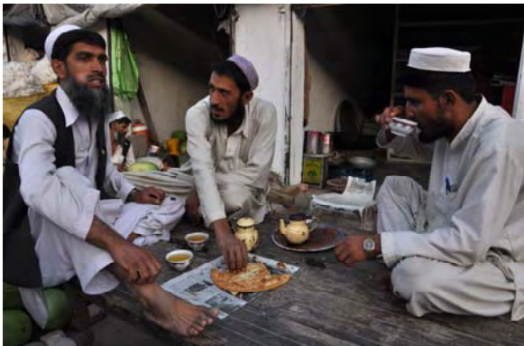
These men share breakfast together as they discuss recent changes in Afghanistan.

Coordinated disaster response is often required in Afghanistan. Canada supports the operations of the International Committee of the Red Cross (ICRC) in providing financial and technical assistance to build the capacity of the Afghan Red Crescent Society, whose 17,000 volunteers across Afghanistan are well trained in emergency response and equipped to respond to people's needs, especially in the south of Afghanistan. The extensive local volunteer network of the Afghan Red Crescent, active in all provinces of Afghanistan, enables the ICRC to reach a large number of conflict-affected people in remote and inaccessible areas of Afghanistan.