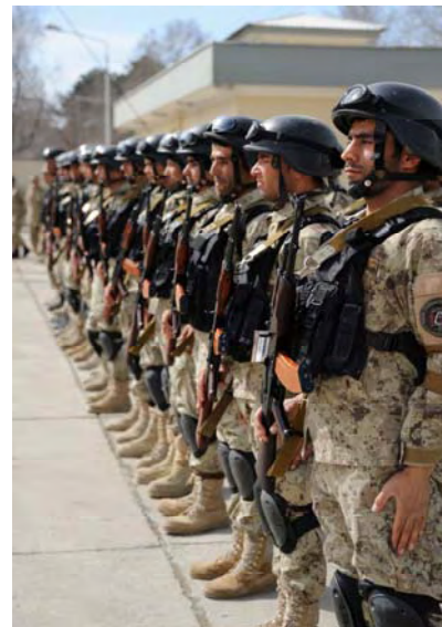
The Afghan National Civil Order Police (ANCOP) Honour Guard stands at attention for the arrival of the Minister of National Defence, Peter MacKay, and the Chief of the Defence Staff, General Walter Natynczyk, to the ANCOP HQ in Kabul.

In addition to the FDD training, and to address ANP recruitment and retention issues unique to Kandahar province, an ANP Officer's Course was also offered at the Kandahar Provincial Reconstruction Team (KPRT) Training Centre—the first time the course has been offered outside of the Kabul ANP Training Academy. Taught by Afghan instructors with mentoring support from Canadian civilian police, 26 students graduated from the course in May.