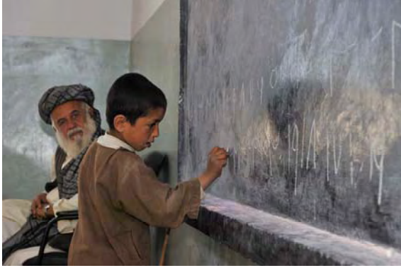
The school located in Dand district, opened on December 23, 2010, after extensive repairs. On an average day, approximately 75 children of various ages attend classes at the school.

In this quarter, the construction of three additional schools was completed, bringing the total of newly constructed or rehabilitated schools to 44; the six remaining schools contributing to Canada's overall target of 50 schools are under construction. More than 50,000 students are expected to benefit from the education project. From a provincial perspective, the Afghan Ministry of Education reported an increase in enrolment of over 15 percent from 2008-09, including a 38 percent increase in female enrolment. Canada is the main contributor to all school construction/rehabilitation implemented by the Ministry of Education in Kandahar.