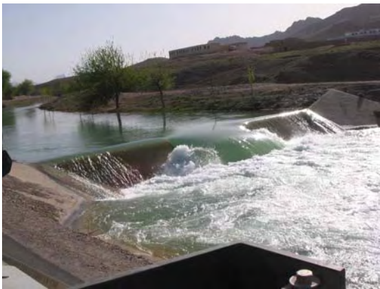
Water flow has been greatly improved along the Dahla Dam irrigation system thanks to Canada's support.

As noted in previous quarterly reports, a sustainable system of Afghan-led and Afghan-owned basic services is fundamental to the future of Afghanistan and to the well-being of its people. The transition to Afghan institutions and international partners of Canadian-funded programs and projects in basic services has focused on the best ways to build on achievements, in order to ensure success going forward.