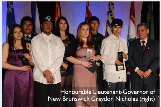
Honourable Lieutenant-Governor of New Brunswick Graydon Nicholas (right)