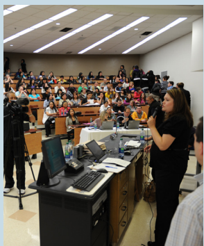
Teams gather for morning announcements and finalist presentations