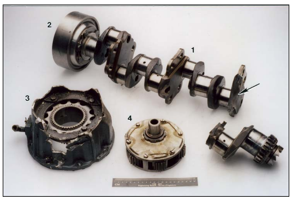
Photo 1. Fractured crankshaft (1) and reduction gearbox assembly (2, 3, and 4)

The fractured crankshaft and parts of the engine-to-propeller reduction gearbox assembly are shown in Photo 1. The location of the failure, as shown in Photo 1 by the small arrow, was at the forward fillet radius of the number six connecting rod journal (see Photo 2–Close-up of fractured crankshaft).