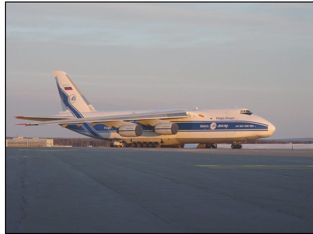
Photo 1. AN 124-100, registration RA-82078

The Volga-Dnepr Airlines Flight 2100 (VDA 2100) had departed Greer, South Carolina, United States, at 2236 Newfoundland daylight time. 1 The en-route portion of the flight was uneventful. Before descent into Gander, it had been decided to approach and land on Runway 03/21, the longer of the two available runways. The Volga-Dnepr Airline crews, who were frequent visitors to Gander, usually used the longer runway if conditions permitted.