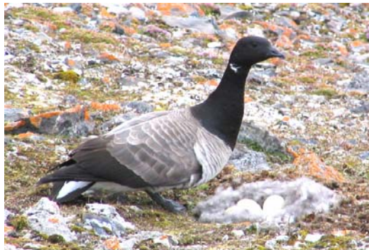
Species: Branta bernicla hrota Light-bellied Brant

The goal of the survey is twofold: to characterize the strains of avian influenza viruses and to ensure early detection of highly pathogenic avian influenza strains in wild birds in Canada. Expanding on the 2005 nation-wide survey of influenza virus strains of wild ducks, this survey places a greater focus on birds that migrate regularly between Canada's North Atlantic region and Europe or that spend some part of their year in close proximity to birds that winter in Europe. The expansion of the survey complements work being carried out in the United States, which is surveying western (Pacific Flyway) populations.