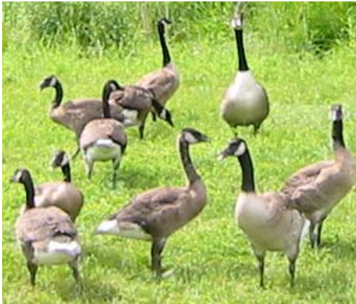
Species: Branta canadensis Canada Goose

The goal of the survey is twofold: to characterize the strains of avian influenza viruses and to ensure early detection of highly pathogenic avian influenza strains in wild birds in Canada. Expanding on the 2005 nation-wide survey of influenza virus strains of wild ducks, this survey places a greater focus on birds that migrate regularly between Canada's North Atlantic region and Europe or that spend some part of their year in close proximity to birds that winter in Europe. The expansion of the survey complements work being carried out in the United States, which is surveying western (Pacific Flyway) populations.