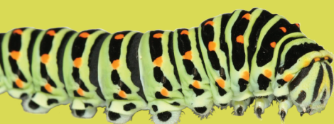
Black swallowtail caterpillar