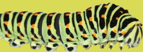
Black swallowtail caterpillar

Many heads are better than one! Talk to people about your concerns; they might join your improvement efforts.