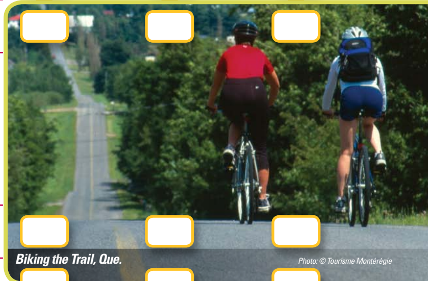
Biking the Trail, Que.