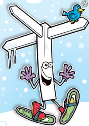
Illustration: © Dominique Pelletier

“Now that you’ve gathered an abundance of observations, use them to reach your own diagnosis about the health of your urban environment by filling in the chart opposite.”