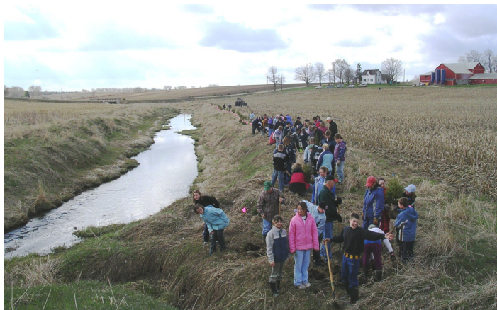
Students participate in a shoreline re-vegetation project that will help to reduce nutrients and improve water quality in the nearby stream and ultimately Lake Erie.

At the same time, habitat protection and restoration projects are also underway in the Maumee River watershed. GLRI projects totaling more than US$6 million are effectively restoring wetland, coastal, and riparian habitats resulting in improved water quality, healthier fish and wildlife populations, and increased property values near restored areas. These projects are benefitting many species of concern.