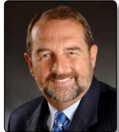
The Honourable Denis Lebel, P.C., M.P.

Working together, we will accomplish more and ensure Canada remains well-positioned for the future.