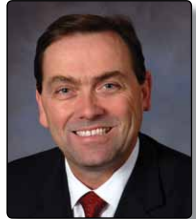
The Honourable Robert Vessey Minister of Transportation and Infrastructure Renewal

As Minister responsible for infrastructure on Prince Edward Island, I look forward to continued partnerships that aim to address critical areas in need of improvement from one end of the Island to the other. I am very pleased with what we've accomplished thus far and I am optimistic those partnerships will continue well into the future.