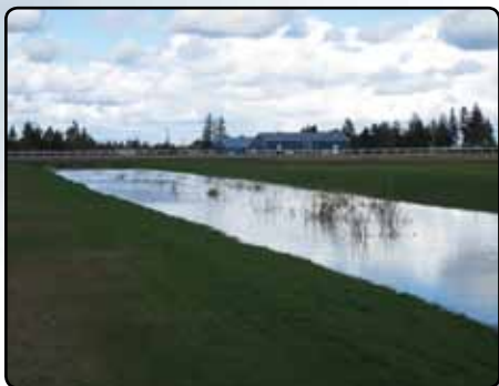
Water treatment lagoon in Tyne Valley

The Communities Component of the Building Canada Fund recognizes the unique infrastructure needs of smaller communities (populations fewer than 100,000), focusing on projects that meet economic, environmental and quality-of-life objectives. Under the Communities Component and Top-up, more than 50 community projects worth more than $70 million are being funded across the province. These projects are improving wastewater treatment capacity, drinking water infrastructure, local roads and bridges, sports and recreation facilities, and cultural spaces.