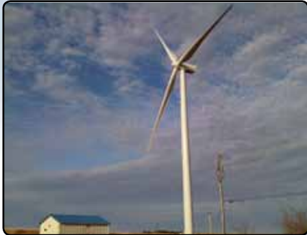
A wind turbine at the Summerside Wind Farm

Residents of Summerside are now benefitting from greater use of clean renewable energy