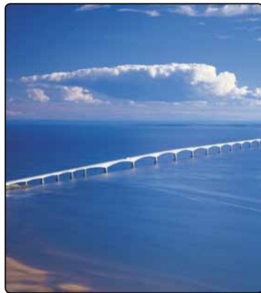
The Confederation Bridge

Looking to the future and the challenges that lay ahead, the Province is also focusing on other priorities, including disaster mitigation, green energy, public transit, health and education.