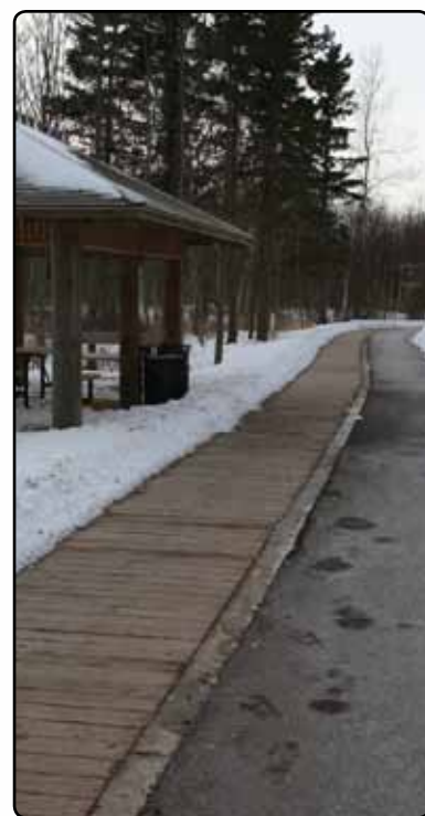
Summerside West End Walkway, Prince Edward Island

By increasing the capacity of its wastewater treatment facility, the community of Tyne Valley can move ahead with economic development activities. The $1.2-million project completed upgrades that will allow further residential and business development in this rural community, including connecting several existing homes to the system.