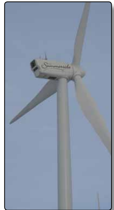
A wind turbine in Summerside

Investing in renewable energy production continues to be a priority for the Province of Prince Edward Island and it is actively seeking new investment opportunities.