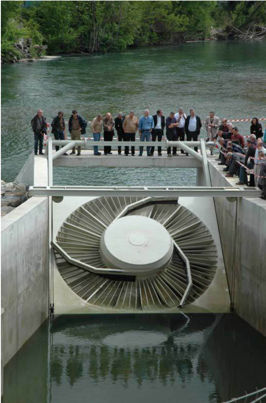
Figure 2. Image of a very low head turbine in working position, without water flowing through sluiceway (Photo: Leclerc, 2007).