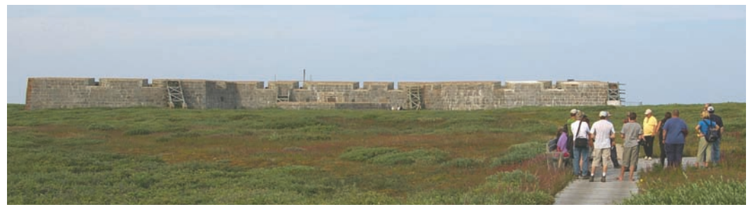
Fort tour

The vision is meant to convey the special character of Prince of Wales Fort NHSC and to paint an inspiring picture of the future state over the next 15 to 20 years.