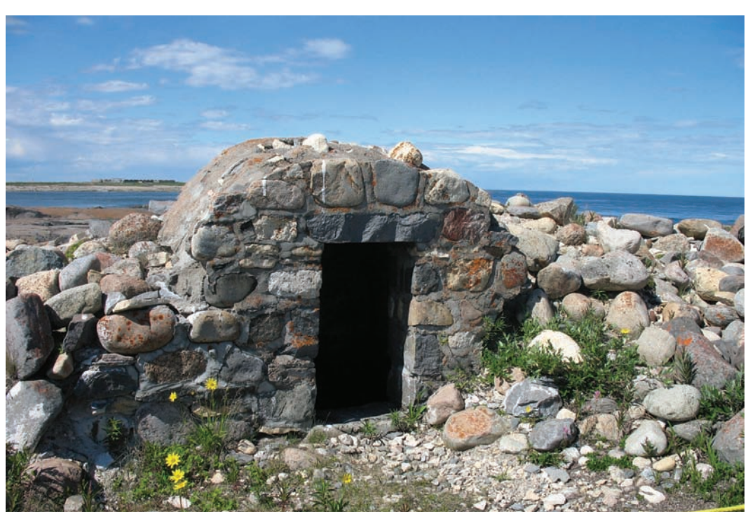
Cape Merry Battery

decisions and actions affecting the site. Public appreciation and understanding, including stakeholder and partner support for the site, is assessed using measurement tools such as the Parks Canada Agency National Survey of Canadians and the Stakeholder and Partner Engagement Survey. Visitor experience is also evaluated using a variety of surveys, including entry and exit surveys, to gather information on the number of visits, and the enjoyment, learning, satisfaction and meaningfulness of a visit to the visitor. The results from this suite of indicators are also compared to management targets. Collectively, this information is summarized in the "State of Site" report to build a snapshot of the site, report on the site's performance and identify key issues to be considered in management planning. These issues are then addressed in the management plan, following consultation and decision-making, starting the cycle over again.