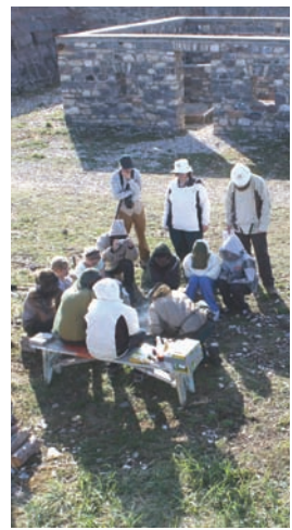
Youth camp inside the fort