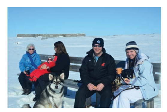
Community trek to the fort as part of the Aurora Winterfest, March 2011