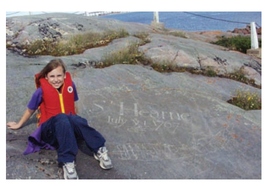
Samuel Hearne's 1767 inscription at Sloop Cove

The batteries were also found to display deterioration of the lime mortar due to water infiltration and willow root action. The 2007/2008 CI Evaluation (Parks Canada) indicated that the mitigation measures implemented to control foot traffic had been largely effective although deterioration of the lime mortar continued. The evaluation also stated that resources not related to designation such as the guarry sites at Cape Merry were not regularly incorporated into the heritage presentation program.