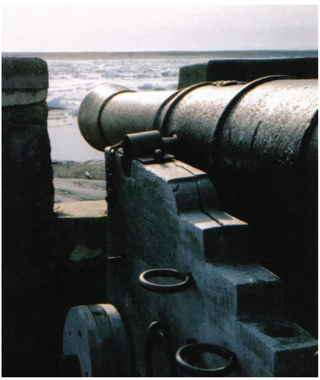
Cannon at Cape Merry Battery

The Prince of Wales Fort NHSC Management Plan will have several positive effects. As a result of the actions in the plan and the mitigation described, and in combination with appropriate project-specific environmental assessment mitigation, negative cumulative effects are not expected.