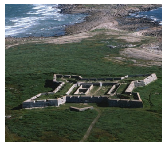
Prince of Wales Fort on the West Peninsula

the planning team. The public was also invited to submit comments to the Parks Canada website or via a feedback form included with a newsletter.