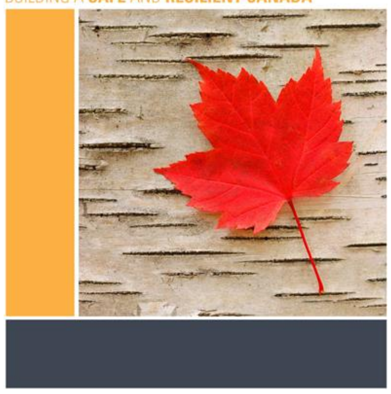
BUILDING A SAFE AND RESILIENT CANADA