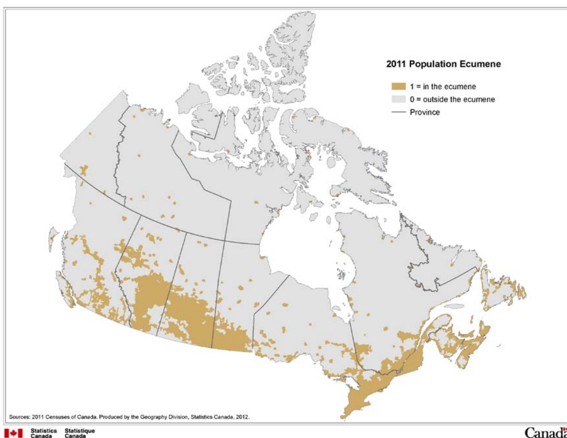
Figure 3.1 Example of an ecumene mask with the provinces and territories generalized cartographic boundary file

In choropleth map applications, one of the inherent limitations is that the statistical distribution is assumed to be homogeneous or uniformly spread over each geographic area, and is consequently represented by a single tone or colour covering the entire area. Using an ecumene limits the display to only those areas where population is found and results in a more accurate representation of the spatial distribution of data.