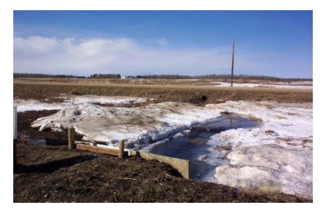
WEBs modellers are creating a refined model to better account for Canadian climatic conditions such as snowmelt, frozen soils and other factors.

The Soil and Water Assessment Tool (SWAT) is the primary hydrologic model used in most WEBs watersheds. Some modelling components have been modified to better suit Canadian climatic conditions and to accommodate specific BMPs. Coined CanSWAT, this adapted model has valuable applications within Canada as well as regions within the U.S. where the dominant hydrology is driven by snowmelt runoff.