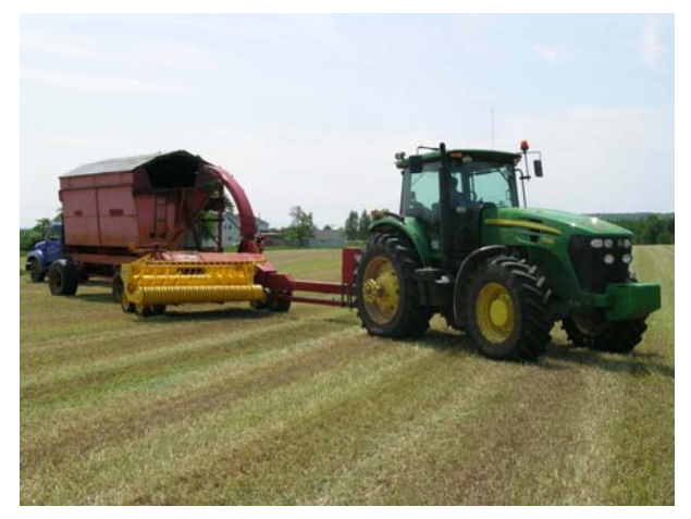
WEBs includes a significant economics component to determine the on-farm and off-farm benefits and costs of BMP adoption.