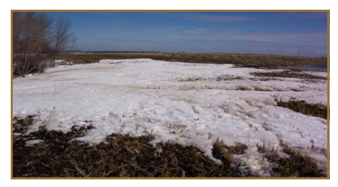
Figure 4: Conservation tillage may not reduce the export of dissolved P in snowmelt runoff.

These findings suggest that the increase in total P is due to an increase in dissolved P released from crop residues during freeze-thaw events, and/or from soil P that accumulates in surface soils because it has not been mixed during tillage. Results demonstrate that although conservation tillage can effectively reduce sediment and sediment-bound nutrient export from agricultural fields, it can increase the export of dissolved P occurring during snowmelt runoff. In these situations, it may be appropriate to implement additional management practices (such as intermittent tillage) to reduce the accumulation of P at or near the soil surface. These findings could apply to much of the cold, semi-arid landscape of the Canadian Prairies (Figure 4) and may be relevant wherever snowmelt runoff dominates and dissolved P is the major form of P in runoff.