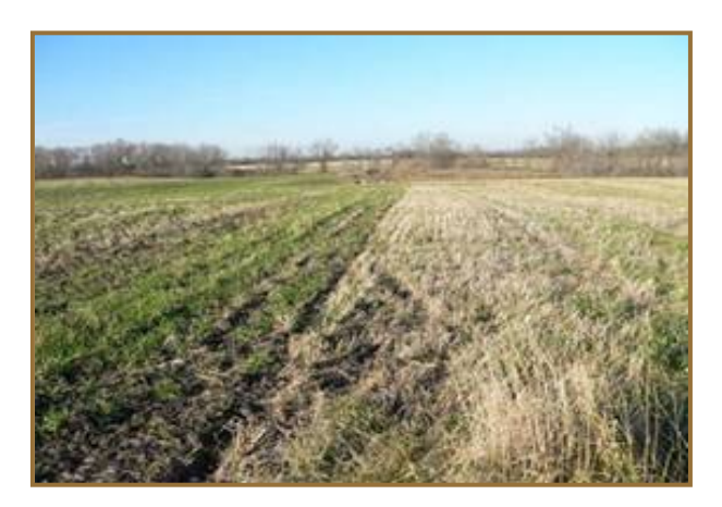
Figure 2. Conventionally-tilled field on the left, conservation-tilled field on the right

The term conservation tillage can be applied to practices ranging from minimum tillage to zero tillage—as is the case in the STC economic analysis. In the STC biophysical (twin watershed) study, conservation tillage refers to a field treatment that approached zero tillage. It received no heavy duty tillage in the fall, yet soil disturbance sometimes occurred prior to spring seeding when ammonia fertilizer was injected in a separate field operation, or when harrowing was used to break up the straw cover.