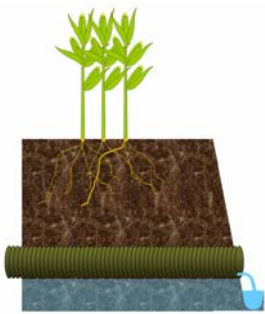
Figure 1: Uncontrolled drainage

With uncontrolled drainage (Figure 1), drainage occurs from the tile directly into the water body (usually a ditch or municipal drain). With CTD (Figure 2), flow control structures are installed on the tile headers.