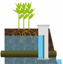
Figure 2: Controlled tile drainage

CTD structures are opened in the spring to permit free drainage and allow for field operations and improved soil aeration. The structures are then closed to restrict drainage, storing nutrient-rich water that crops can access during the growing season. This BMP reduces nutrients in surface water by reducing the volume of tile drainage water leaving the field. As a result, CTD may completely eliminate tile outflow in dry years.