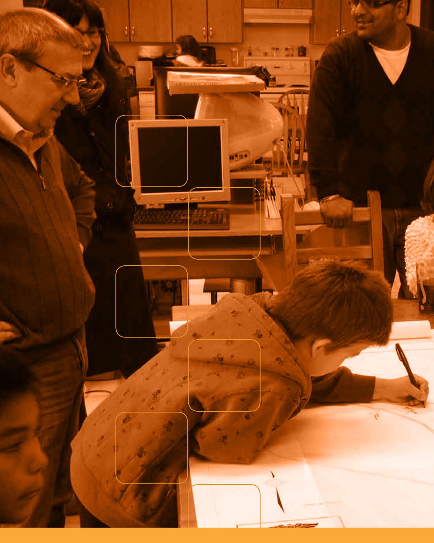
strong community involvement