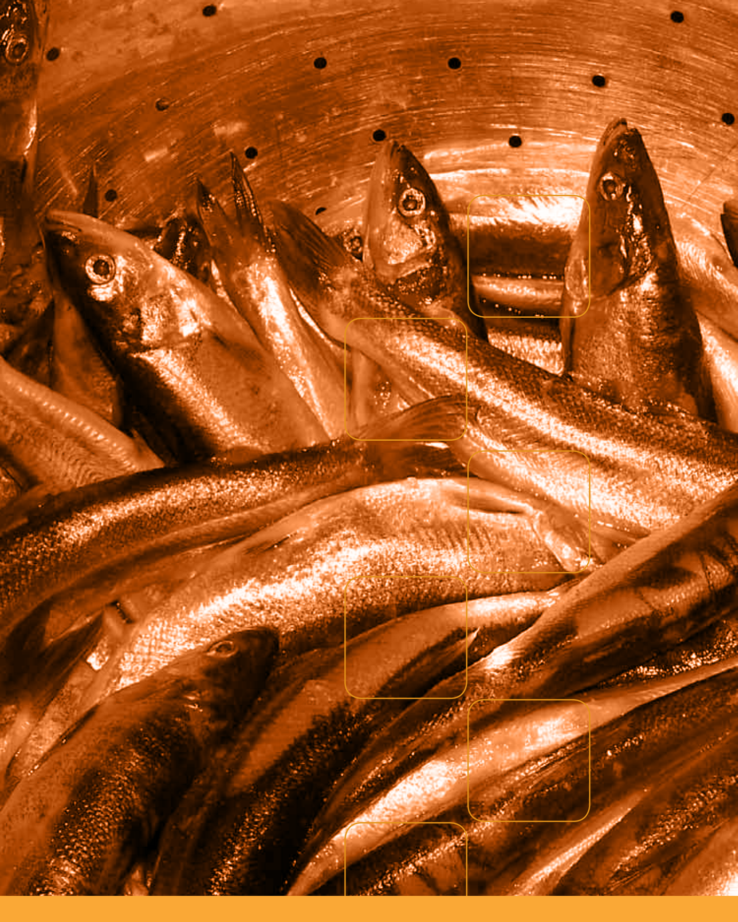
culture, history & sustenance