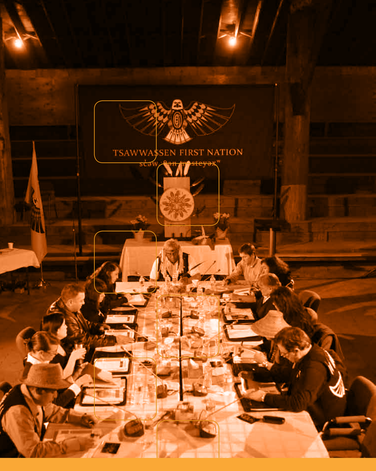
policies, procedures & protection