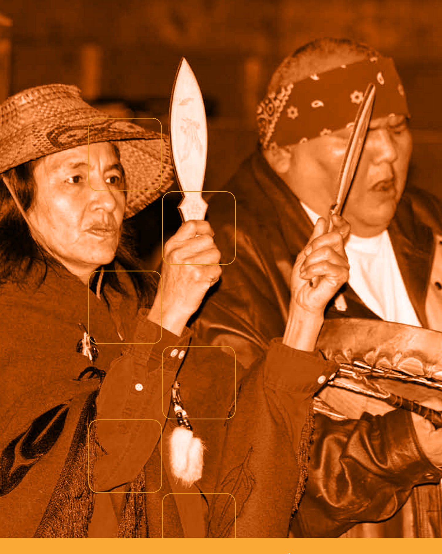
respect & opportunity