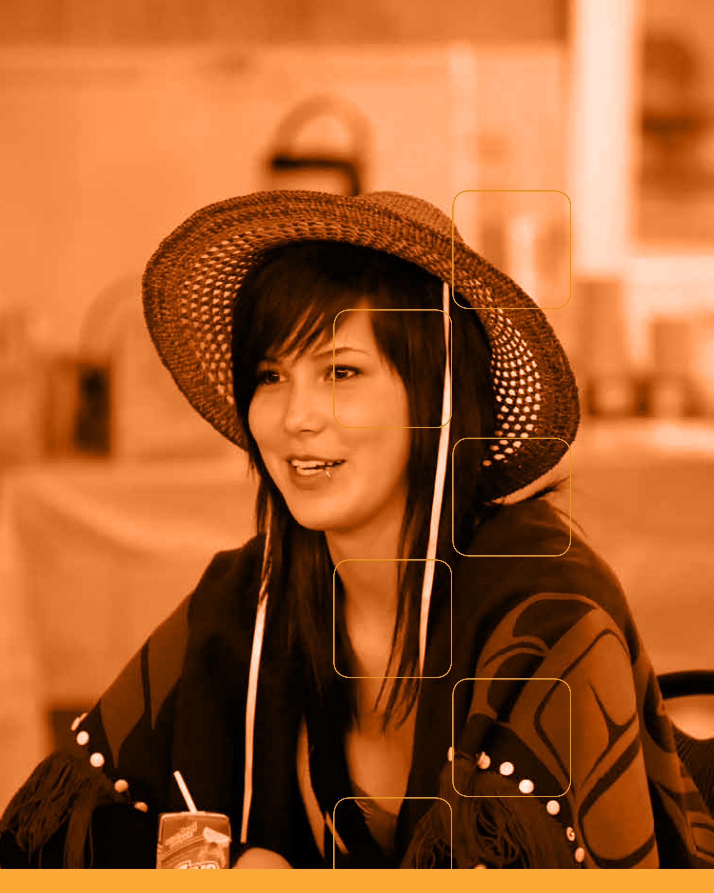
environmentally & culturally sustainable