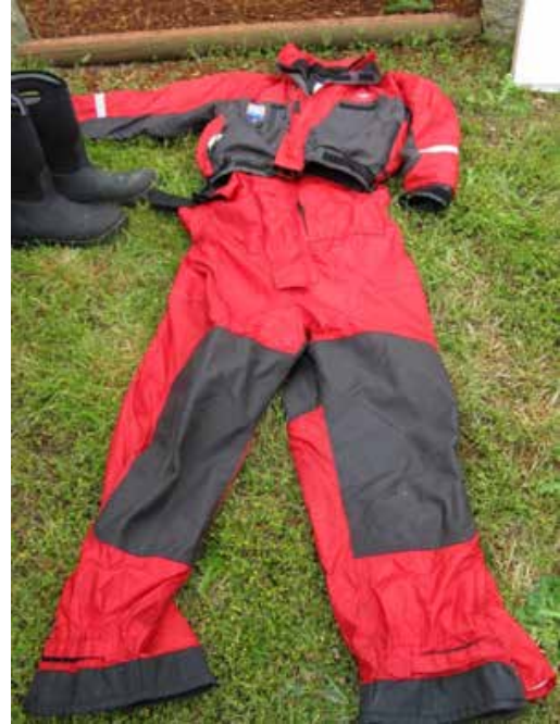
Photo 3. Marine anti-exposure suit

A dry suit, when worn with thermal undergarments, thermally insulates the body. Dry suits are designed with watertight zippers and seals around the neck and hands to prevent water ingress, making them more suitable for use in cold water. The suit normally protects the whole body, with the exception of the head and the hands. However, dry suits can be uncomfortably hot in warm temperatures, and are typically more expensive and more complex to put on than other types of PPE. Dry suits do not provide buoyancy, so a PFD must be worn to provide the necessary flotation.