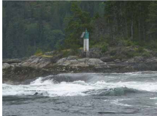
Photo 2. Green light marking southwest extremity of Sechelt Islets

The strongest flood stream occurs to the southeast and west of Sechelt Islets. The strongest ebb stream occurs just west of the green light on Sechelt Islets (Photo 2), with a strong cross-channel set toward the west-northwest. A large back-eddy occurs to the north of the light, and whirlpools form close to the light. On 03 June 2012, the predicted time of maximum ebb current at Sechelt Rapids was 0940, at 13.6 knots. The next predicted time of slack water was 1414.