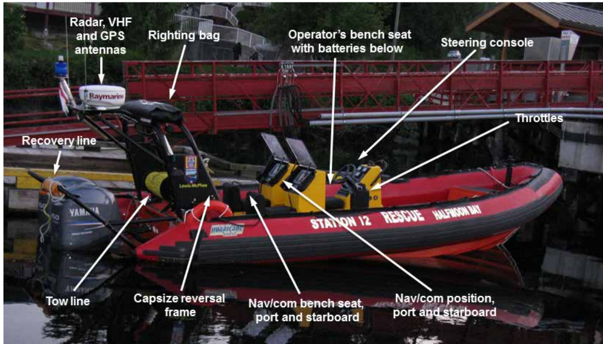
Photo 1. RCM-SAR Lewis-McPhee

The vessel is fitted with a self-righting system that is mounted on an aluminum frame. A righting bag, which can be manually activated via a pull handle located on the transom, is housed on top of the frame. The radar dome and antennas for the very high frequency (VHF) radiotelephone and global positioning system (GPS) are located on a platform just aft of the righting bag.