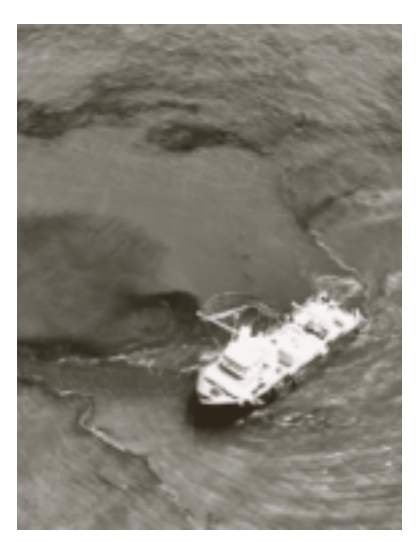
Skimming oil from the surface of the ocean after a spill