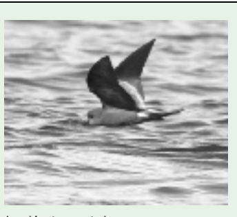
Leach's storm-petrel

Many species of seabirds are protected under the Migratory Birds Convention Act, 1994 , but seabirds may be killed or injured when they are attracted to offshore oil and gas platforms by increased food availability, lights, or natural gas flares. Seabirds are sometimes also exposed to oil sheens from operational discharges or spills. Studies have shown that oil-fouled feathers affect the buoyancy of birds and their ability to regulate their body temperature when swimming in cold water, with a possible result of death by hypothermia or starvation. In addition, ingested oil can impair the functioning of birds' internal organs.