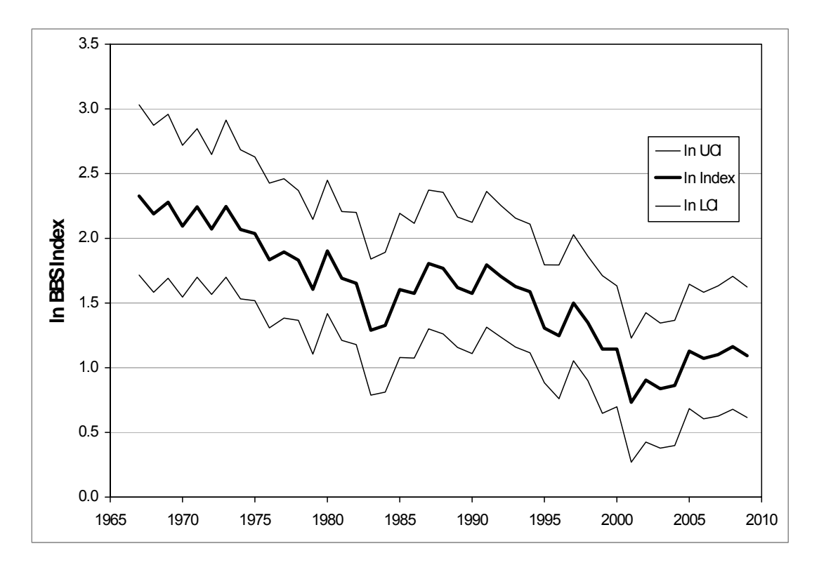
Figure 3. Baird's Sparrow rangewide population trend in North America from 1967 to 2009, based on a hierarchical analysis of Breeding Bird Survey data (adapted from Sauer et al. 2011).