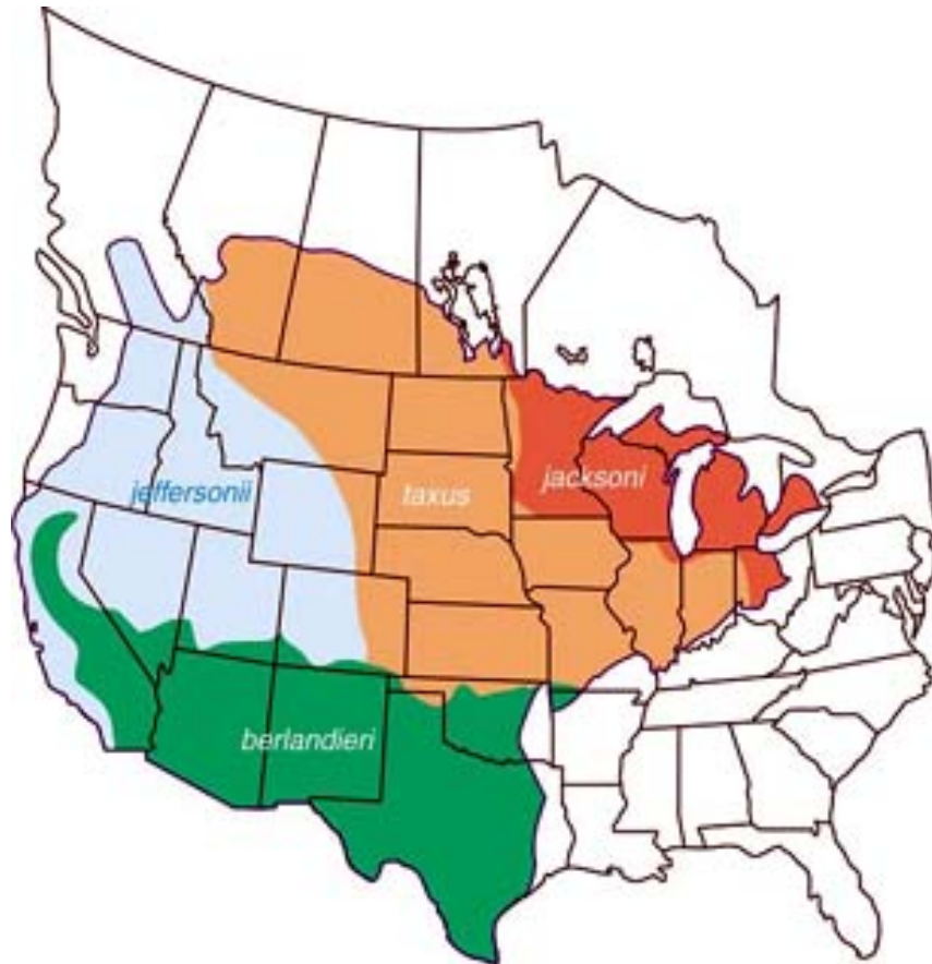
Figure 1. Approximate ranges of the four American Badger subspecies in North America

There is thought to be significant overlap in the ranges of subspecies, with intermediate forms occurring in the areas of overlap.