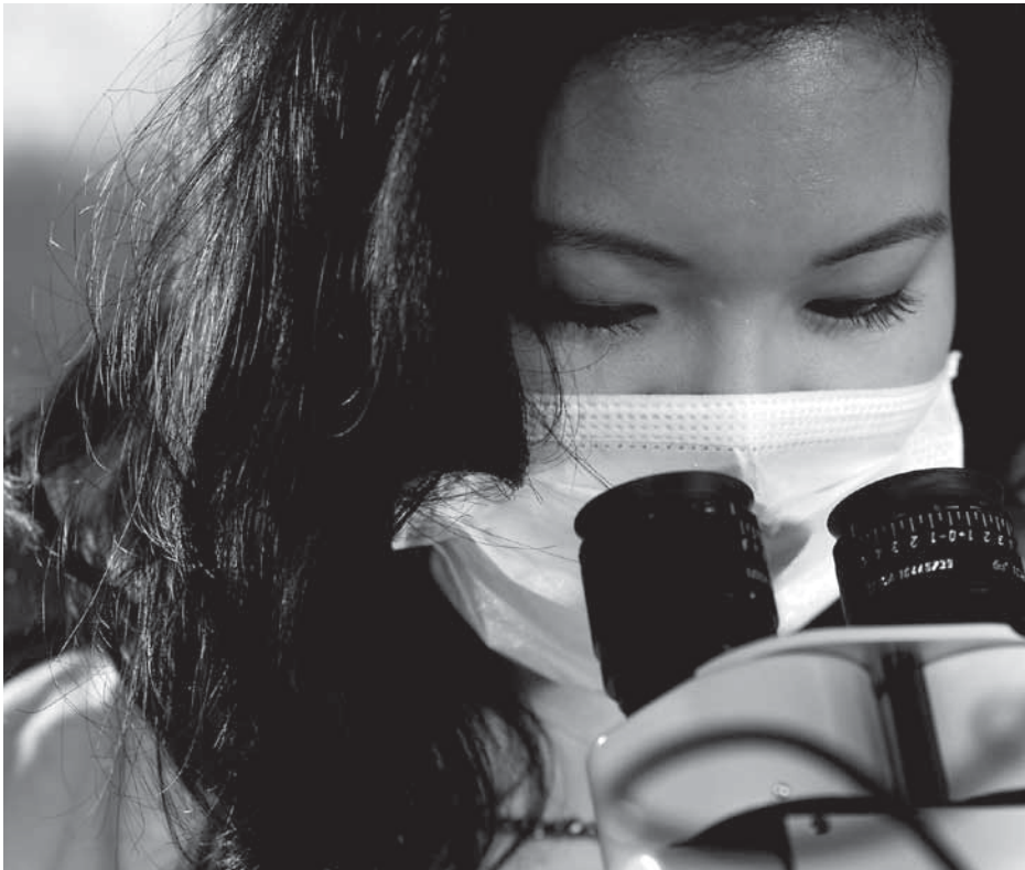
Little empirical evidence is known about the value of DNA testing large numbers of sexual assault kits that have long been held in police property rooms.

found that there was little immediate criminal-justice value in testing the large number of previously untested SAKs that were in the LAPD and LASD property rooms. What is unknown, of course, is whether there may be future dividends — that is, the potential to solve future crimes — from uploading the profiles to CODIS in cases that had not been previously adjudicated.