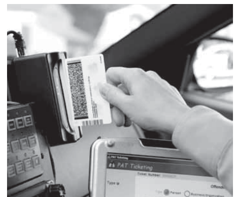
E-ticketing allows members to swipe licences and upload information to both the RCMP and Nova Scotia Department of Justice case management systems.