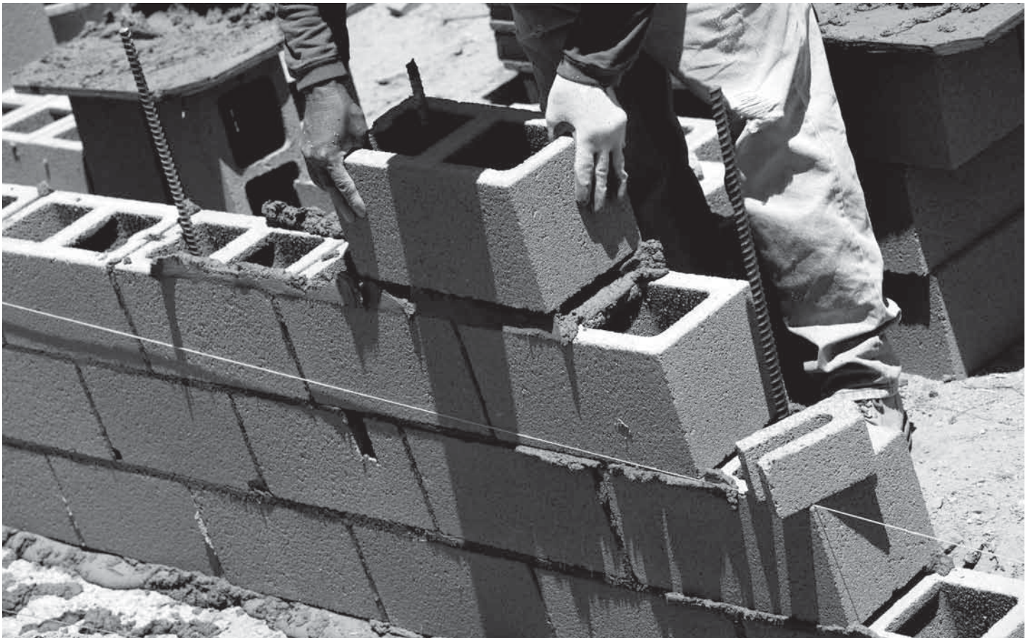
Various types of human trafficking — temporary foreign workers and domestic workers, for instance — are potentially falling outside of a criminal justice response.

among agencies involved in supporting victims of human trafficking, and supporting the prosecution of the criminals.