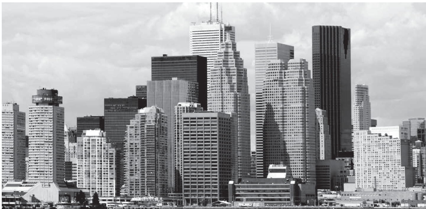
The RCMP's IMETs are keeping criminalized professionals, some of whom might work on Toronto's Bay Street financial district, on their radar.