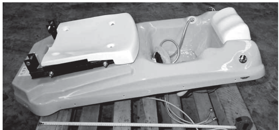
Australian Federal Police

Project OSPA uncovered a shipment of massage chairs destined for Australia that contained concealed drugs worth $110 million.