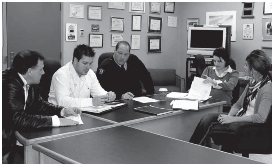
Local RCMP Community Programs Officer and community partners in Campbellton meet to discuss youth at risk in the community.