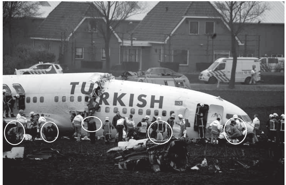
A number of citizens (circled) helped emergency responders after the Turkish Airlines crash in 2009.

It was suggested they could do what block parents do: keep informed about what's going on in their block. When an emergency occurs, they would not only know who was at home and who was away, they could keep track of who was rescued and who rescued them. This information would help responders identify who, in all probability,