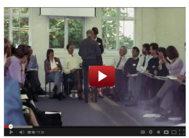
Retrospective of The Cochrane Collaboration's beginnings and achievements of the past two decades.

The IMHA website features a Cochrane Corner which lists Cochrane reviews relevant to IMHA's mandate. The page has recently been updated with new reviews from the Musculoskeletal and Oral Health Groups.