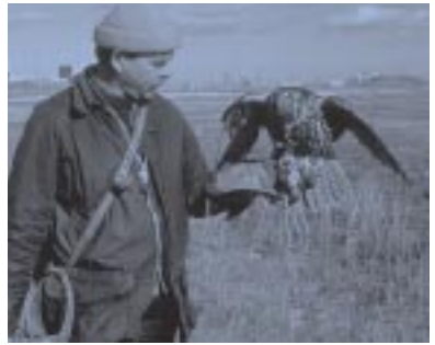
Falconry at airports

Falconry plays upon some birds' natural fear of raptors—their presence in the area is sometimes enough to temporarily disperse problem species. The natural reaction of most prey species is to form a tight flock and attempt to fly above the falcon. If this fails, they will fly for cover, often away from the airport. Caution should be exercised, however, as the direction of dispersal is not always controllable and flocks may fly along or across active runways.