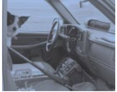
A well equipped field vehicle

The field vehicle is an essential part of any wildlife management program, providing transportation for officers as well as the necessary equipment for dispersing or removing wildlife. The vehicle should meet these general specifications: