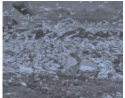
Landfill site near airport

The use of over-wiring or netting to cover the working face of landfills—the area where waste is currently dumped—could prevent or greatly reduce gull use. It has been demonstrated at many sites that portable installation units allow the netting or wiring to be easily shifted as the dumping location changes. Landfills should also be covered daily with soil to reduce bird-food sources, or prior to any period when the landfill will not be attended such as weekends.