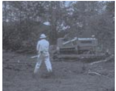
Habitat modification by tree removal

Many airports—civil and military—landscape the areas surrounding buildings, roads and hangars for aesthetic purposes. Decorative trees and shrubs, however, often produce seeds and berries that attract birds, while also providing shelter, roosting, and nesting sites. Dense stands of evergreen trees are particularly attractive roosting sites for starlings and crows.