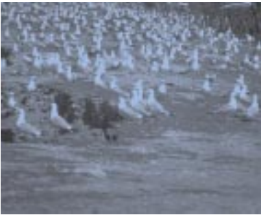
Loafing gulls on an airfield

High-risk species are those that are most frequently involved in strikes, as well as those that cause the greatest damage. Larger birds tend to inflict more damage due to higher impact forces. Since they are more likely to be felt—and provide evidence in the form of easily identifiable remains (feathers, claws, or bills)—strikes to large birds are most often reported. Gulls, waterfowl, raptors, and vultures are some of the most hazardous species at airports.