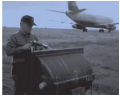
Applying "Hot Foot"