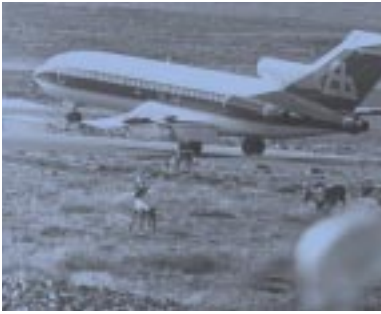
Mammals seen on airport runways

Coyote strikes also occur in North America. At an airport in California, a Coyote was struck by the nose-wheel of an L-1011. Numerous Coyote incidents have been recently reported in Canada as well, including an unlikely occurrence at Calgary in which an Air Canada aircraft hit two Coyotes at once.