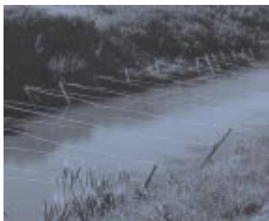
Fine wires on water

At airports, grids of fine wire should be installed over ponds, standing water and other wetlands. Wire grids can also