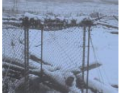
Live trap – mammals