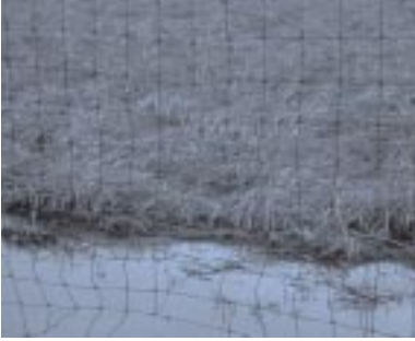
Airport fence with hole

presence of hunters can motivate deer to cross these fences regardless of the pain these barriers inflict.