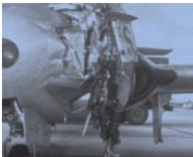
Military aircraft damaged by Turkey Vulture

Windshield strikes can cause cracks, shattering, and penetration. In the worst cases, pilots are exposed to flying glass and bird debris, as well as the powerful airflow resulting from a compromised windshield.