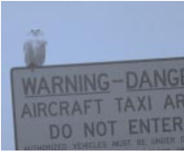
Owl perched on a sign at airport

Another attraction that draws birds to airport tarmacs is the presence of posts, lights, and markers. Many birds, especially birds of prey, like to perch rather than stand on the ground. Any unnecessary posts or structures on the airfield should be removed. Perching can be prevented by installing sharp spikes commonly known as porcupine wire with trade names such as Nixalite. If strips of porcupine wire are attached with hook and loop fasteners, they can be easily removed for maintenance purposes. Individual posts can be made