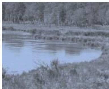
Open water near a runway

Waterfowl and shorebirds are particularly attracted to surface and standing water. As a general rule, all physical features that hold standing water should be modified or eliminated. Pits or depressions that regularly collect water should be drained and back-filled; clogged waterways should be cleared. Using wire to cover bodies of water—such as lagoons—inhibits birds from landing. The banks surrounding these areas should be graded to a 4-to-1 slope to discourage birds from resting in the water—birds are less likely to frequent areas when unable to spot predators above the banks.