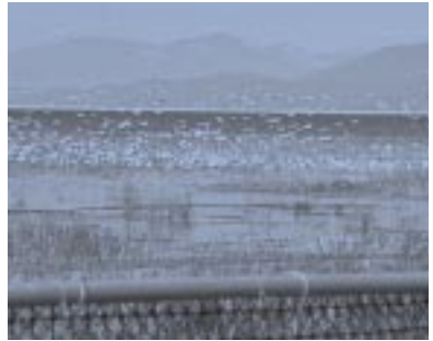
Birds at a water site

Water bodies also attract aquatic mammals such as Muskrat and Beaver. Not only can both of these species inflict severe damage through lodge and dam construction, but they are also attractants, luring carnivorous animals to airports.