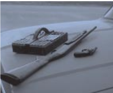
Dispersal guns and shell crackers

Precautions should be taken in any program using pyrotechnics: