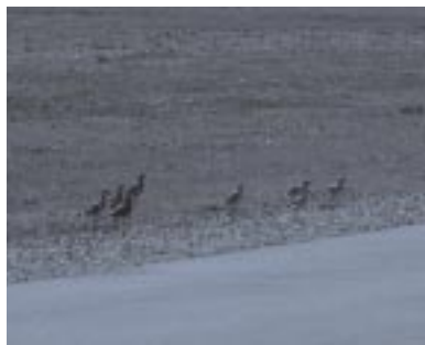
Birds loafing on grassland

Long grass also harbours ground-nesting birds (partridges, pheasants, ducks, owls, harriers), numerous small mammals (mice, voles, hares, rabbits), and large numbers of insects.