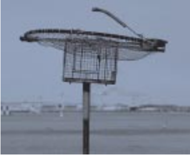
Live trap – birds