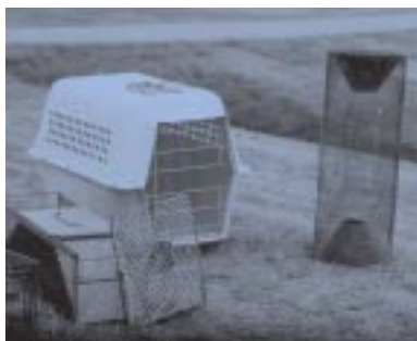
Live mammal traps

Most live traps are made of galvanized wire, and are open at one or both ends. A trigger is tripped when mammals enter these traps, closing the door. Traps used to capture deer and bear are more specialized.