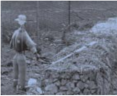
Open drainage ditches that attract birds

space that attract wildlife. Modifying natural and man-made environments—following assessments of problem species and their attractants—can render these areas unappealing and inaccessible to wildlife. This is an effective long-term solution that can minimize problem species in specific areas.