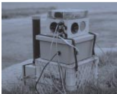
Phoenix Wailer in use

than other similar devices—are said to prevent habituation. These systems protect up to 3,000 feet of runway.