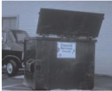
Open edible food waste storage

Edible waste is created at airport restaurants, flight kitchens, and at points where in-flight meals are prepared. Proper storage is critical to ensure the material is inaccessible to birds until it is removed to off-airport disposal sites. Airport property leases should contain clauses that address waste disposal and reduce bird attractions. Feeding of birds in taxi-cab stands should be prohibited.