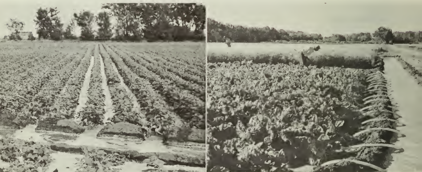
Figure 2 — Furrow irrigation suits row crops. Siphon tubes provide a more accurate and better controlled method of introducing water into furrows than breaking the ditch bank.

Corrugations are a variation of the furrow method. They are shallow, narrow-spaced furrows that help to spread water evenly. You can use them with any of the gravity methods especially for close-seeded crops in much the same way as furrows for row crops. Although you normally run them down-slope, you may place them partially on the contour to avoid steep runs. Use