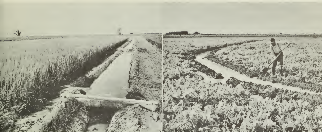
Figure 1 — Ditch irrigation. The field on the left contains border ditches. The contour ditch method on the right requires little land preparation, but labor requirements are high and irrigation efficiency is low.

Some disadvantages of field ditches are: