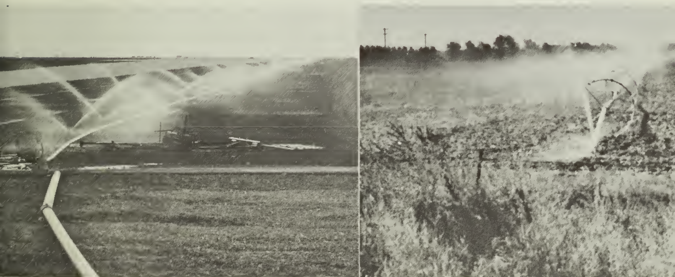
Figure 4 — On the left is a typical hand-move sprinkler line system. On the right is a partly mechanized wheel-move system.