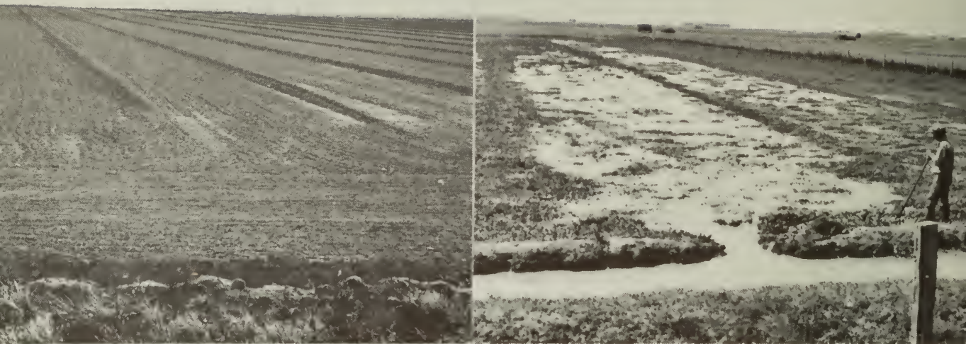
Figure 3 — Considerable land leveling was required to prepare these fields for border dike irrigation. On the right is an adequate, uniform irrigation achieved with a minimum of labor.

capital cost is prohibitive under the present agricultural economy in areas such as southern Alberta. However, there are solid set systems in many urban lawns. In the second, you mount pipelines and sprinklers on wheels, skids, or a self-propelled undercarriage. In the third, you use high pressure to force water over a wide area around each sprinkler, thereby eliminating some of the equipment and the labor required to move it.