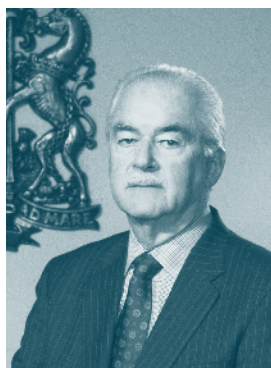
The Honourable Gene McLean