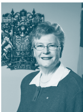
The Honourable Deborah Grey