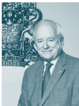
The Honourable L. Yves Fortier