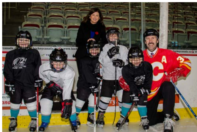
Minister Rona Ambrose and former Calgary Flames player Jamie Macoun with young hockey players from the Calgary region.

On November 4 th , the Honourable Rona Ambrose, Minister of Health, announced funding from CIHR and partners to support research on mild traumatic brain injuries. Of the 19 projects, five are focused specifically on children and youth, and IHDCYH is proud to be contributing to the funding of these teams. Visit the CIHR website for more information about the announcement and funded projects.