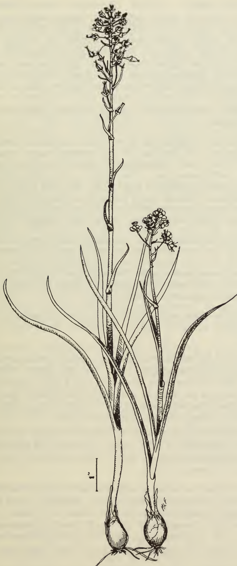
Figure 2 Meadow Death Camas