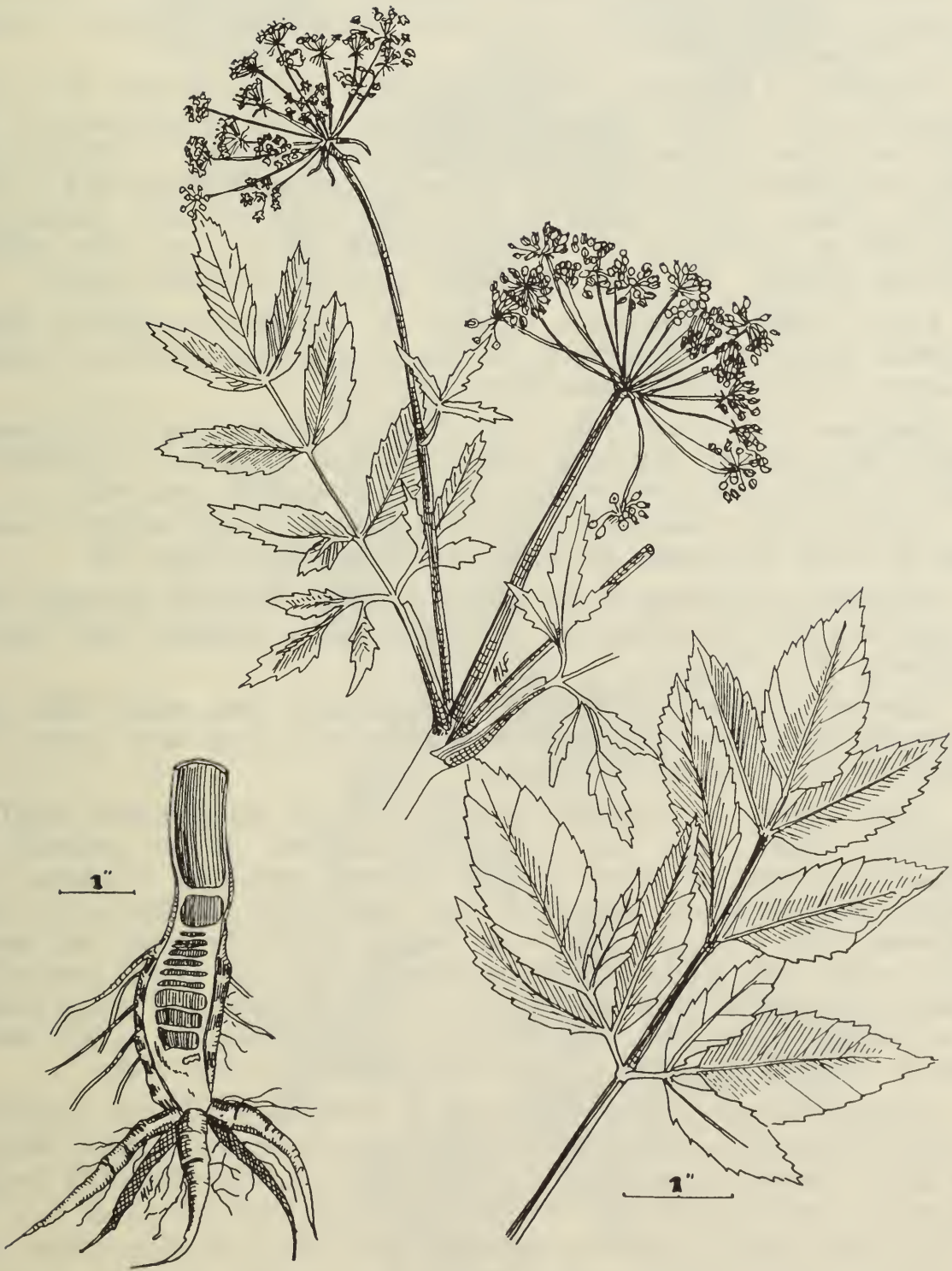
Figure 7 Water Hemlock