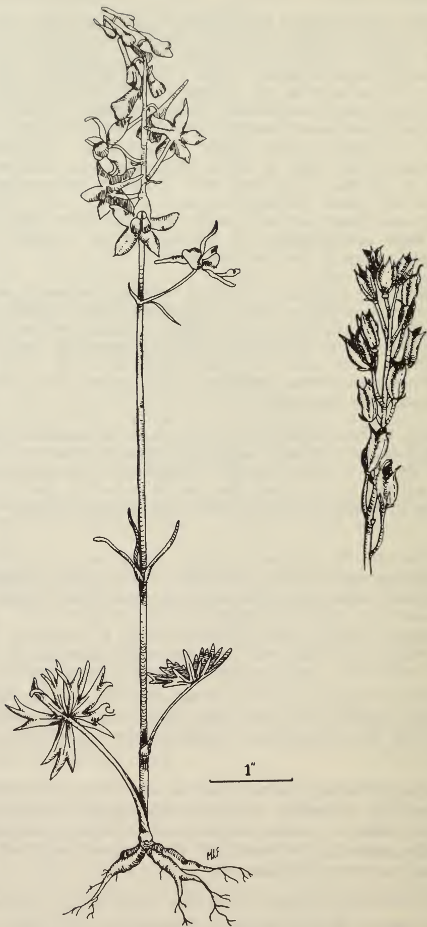
Figure 3 Low Larkspur