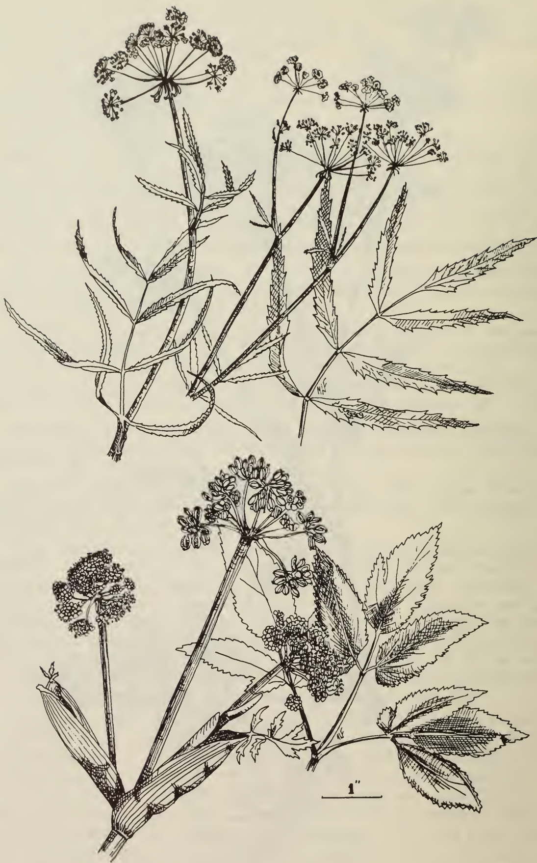
Figure 9 (Upper) Water Parsnip (Lower) Angelica