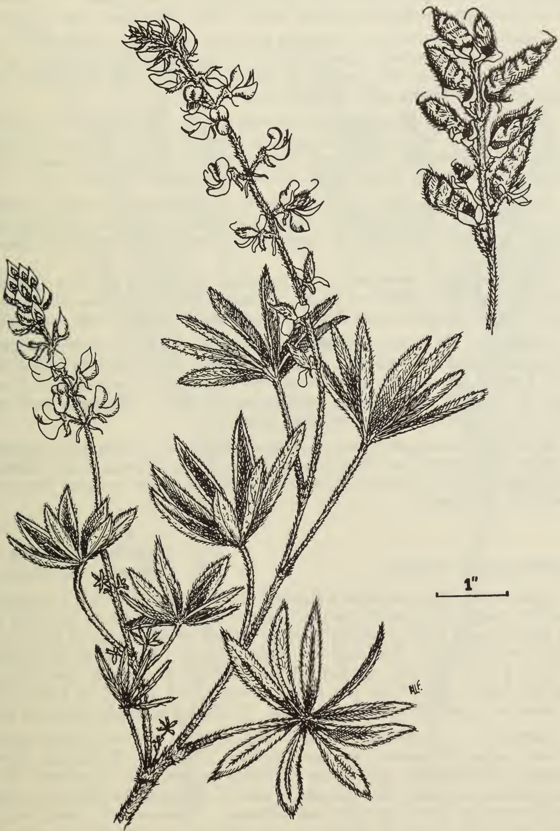
Figure 5 Silvery Lupine