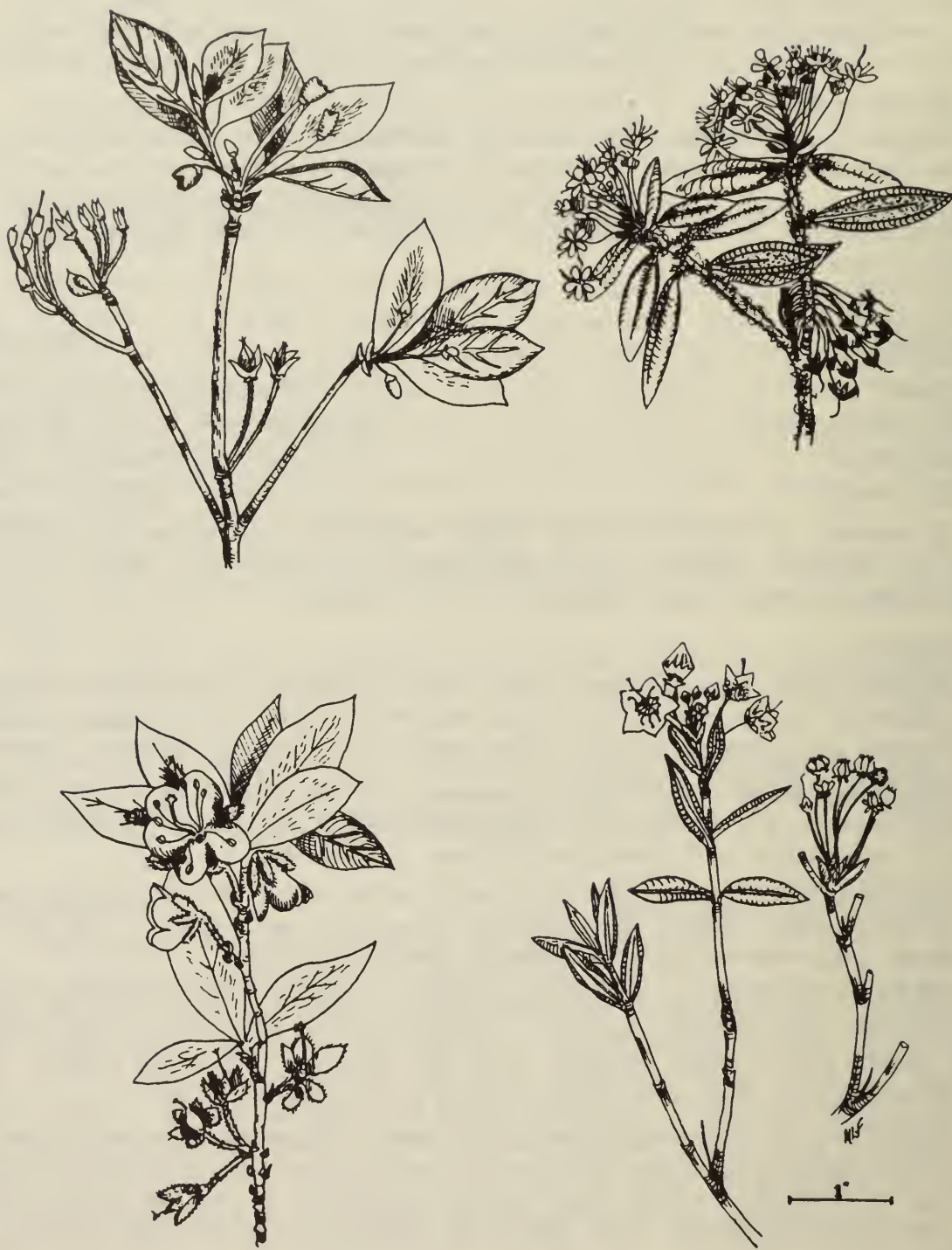
Figure 11 (Upper left) Rustyleaf (Lower left) White Rhododendron (Upper right) Labrador Tea (Lower right) Swamp Laurel