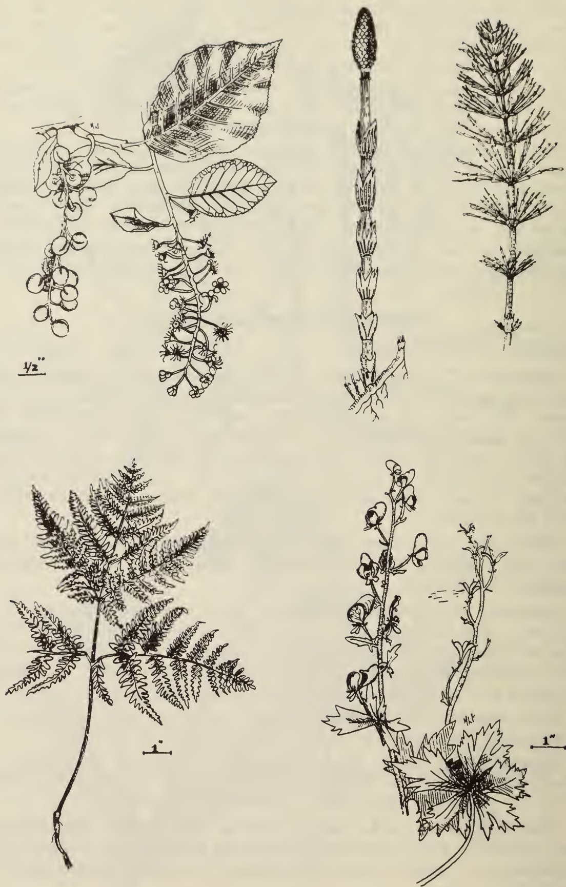
Figure 10 (Upper left) Western Chokecherry (Lower left) Bracken (Upper right) Horsetail (Lower right) Monkshood