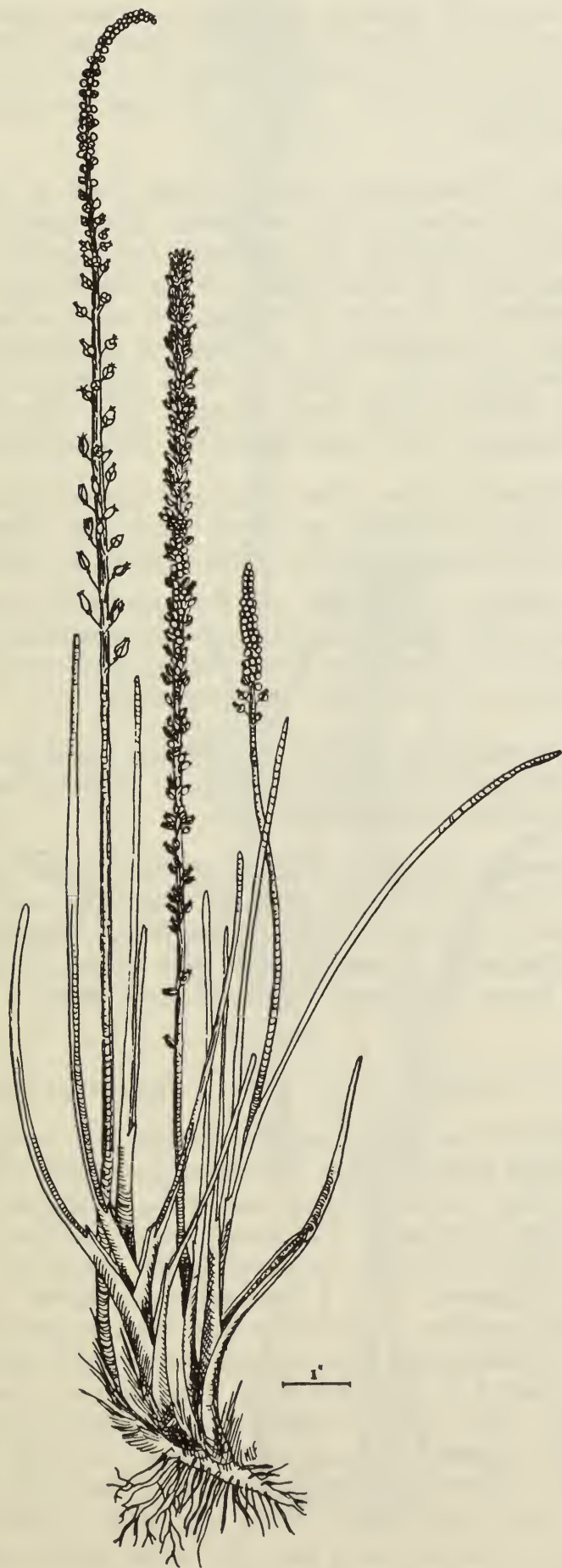
Figure 1 Arrowgrass