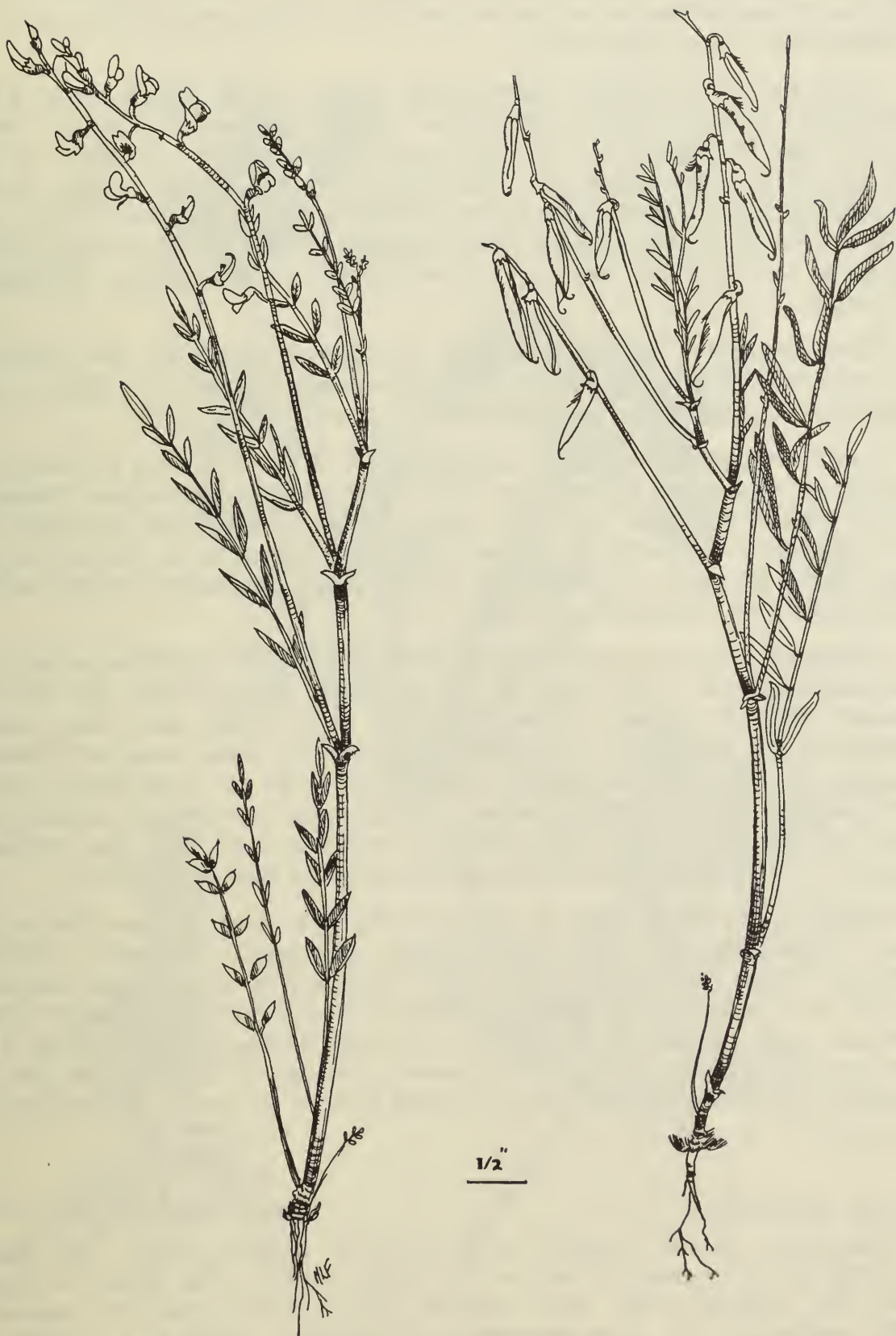
Figure 6 Timber Milk-Vetch