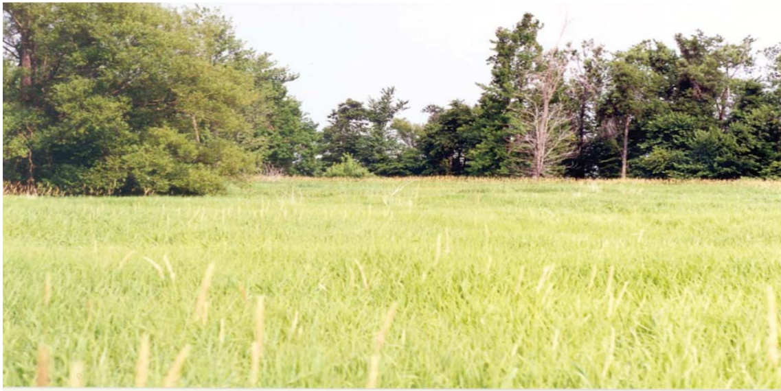
Figure 5: La Grande Île in 1999 – terrestrial habitats and marsh

In the southern part of the archipelago, the islands are sheltered from the winds and currents, which is favourable to the growth of floating aquatic plants. The dominant species is the Tuberous Water Lily ( Nymphaea tuberosa ), and companion species include the Canada Waterweed ( Elodea canadensis ), the Tape Grass ( Vallisneria americana ), the Water Star-Grass ( Heteranthera dubia ), the Nitella ( Nitella sp.) and the Ivy-leaved Duckweed ( Lemna trisulca ) (Grondin et al., 1983).