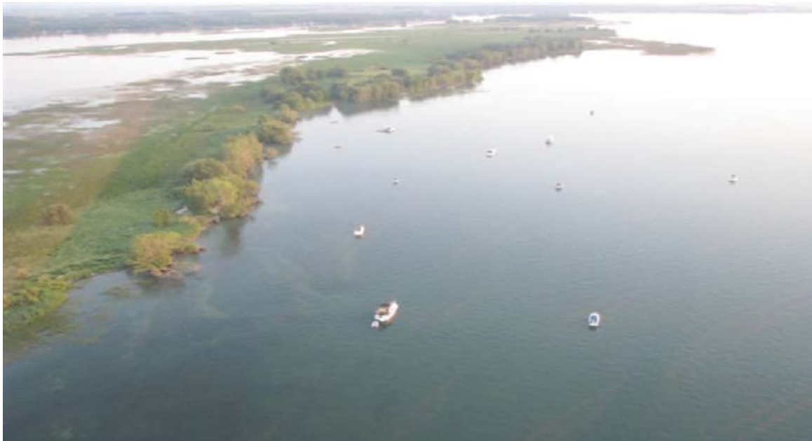
Figure 2: Aerial view of a sector of the Îles de la Paix National Wildlife Area

The Îles de la Paix consist of low-lying, low-relief alluvial stretches, most of which are part of the Îles de la Paix Natural Wildlife Area. The NWA is located within the municipalities of Beauharnois and Léry in the Lake Saint-Louis, a natural widening of the St. Lawrence River, roughly 20 kilometres southwest of Montreal (Figure 2). The islands are located next to one of the most important navigable waterways in North America: the St. Lawrence Seaway.