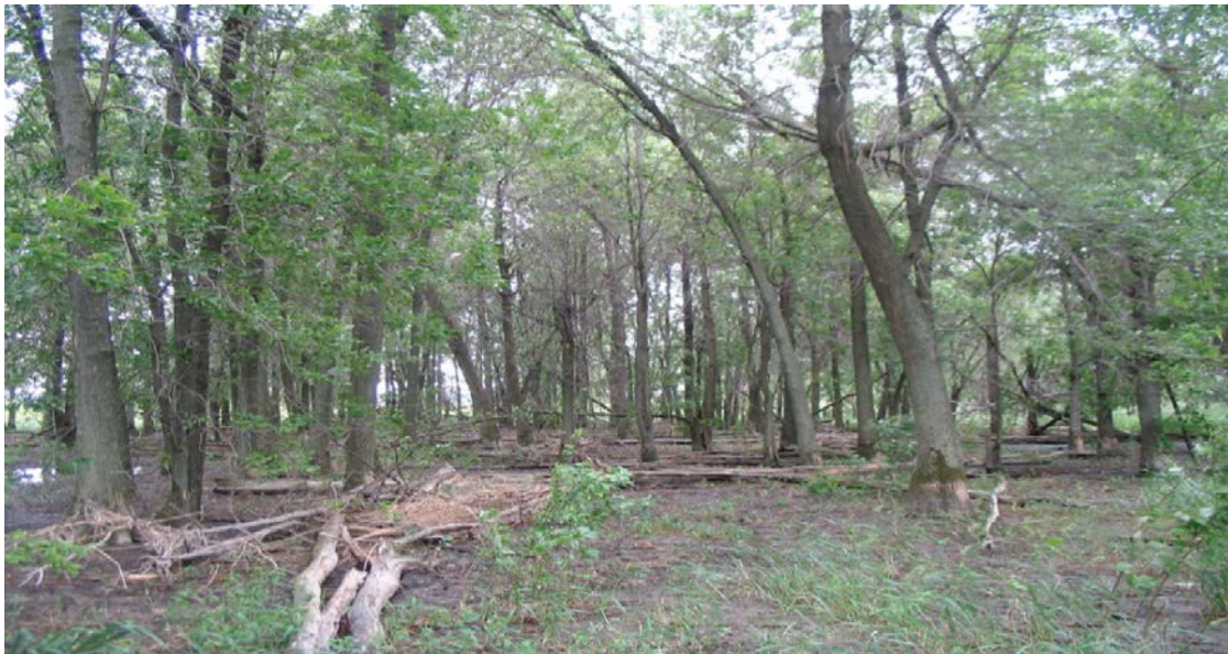
Figure 6: L'île aux Plaines in 2011 – forest subject to water level variations