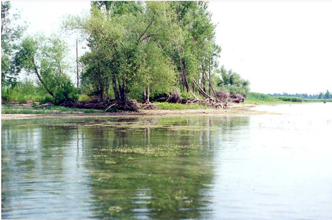
Figure 4: Île à Tambault in 1999; shoreline erosion can be seen